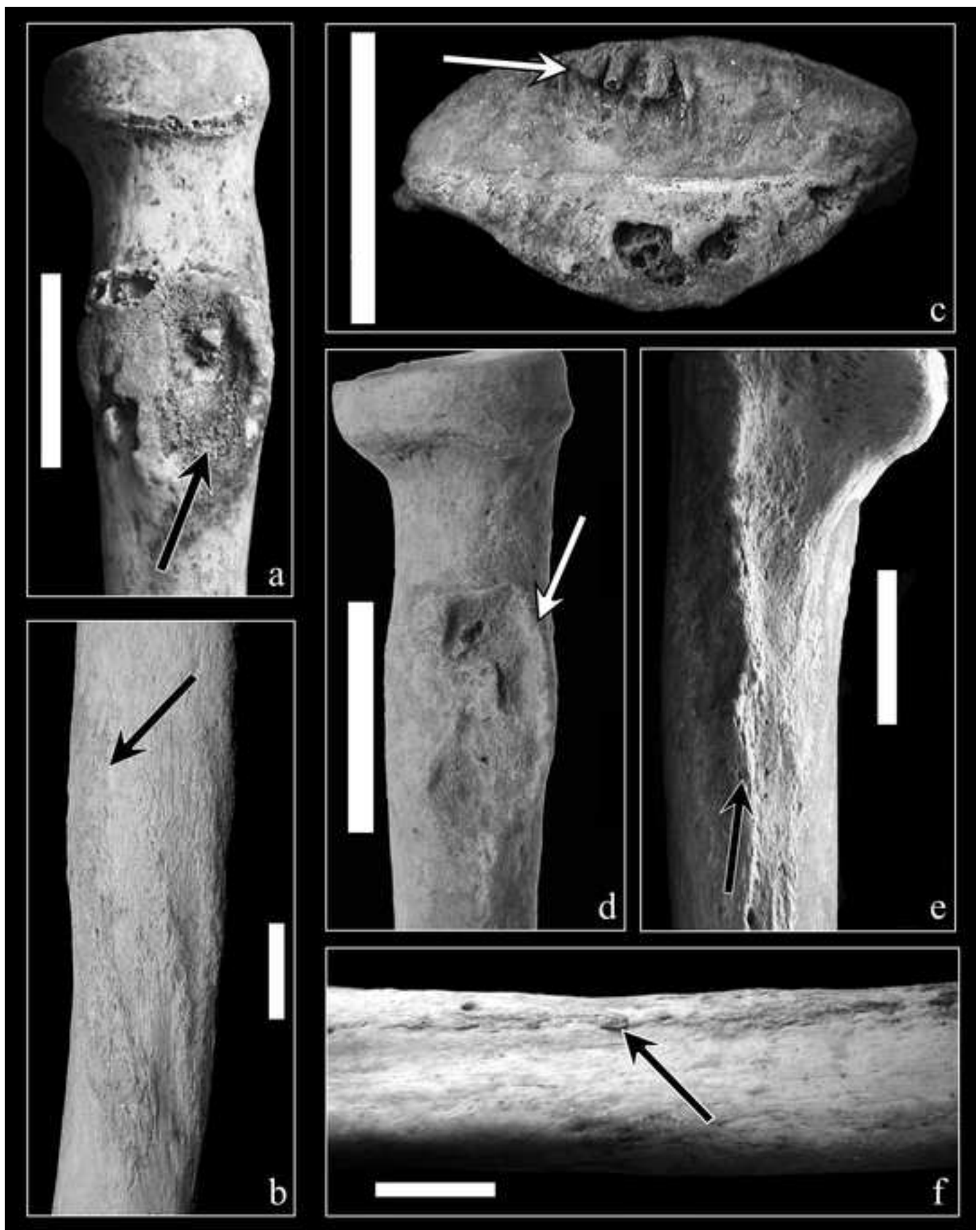
Figure 1 Click here to download high resolution image