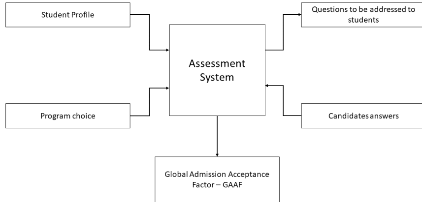
Fig. 2. System Principles

The comprehension of the nature and contexts of the elements leading to the correct evaluation will guide the choice of knowledge models and processing methods. The proposed architecture will contain several communicating building blocks. Working on the algorithm requires treating a list of modules that build up the main architecture.