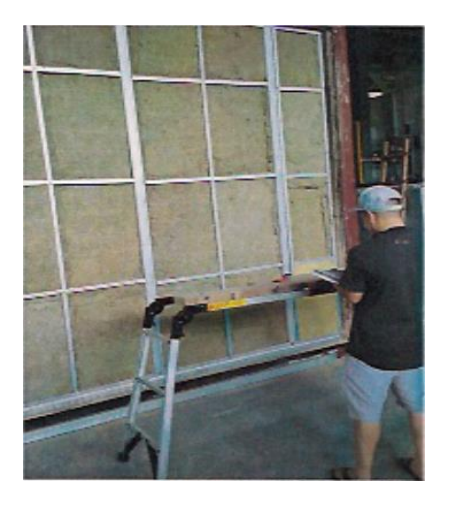
Plate 1. Before the test. (during the construction showing the rockwool infilled and studs)