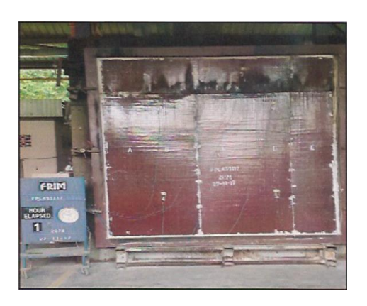
Plate 4. During the test. (Time taken: 106 mins)