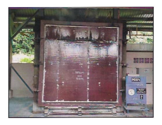
Plate 3. During the test. (Time taken: 95 mins)