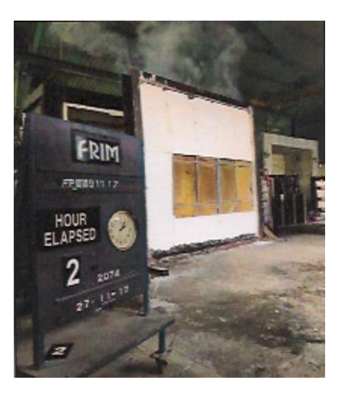
Plate 6. After the test.

Figure 3: The photograph of the unexposed face of the specimen