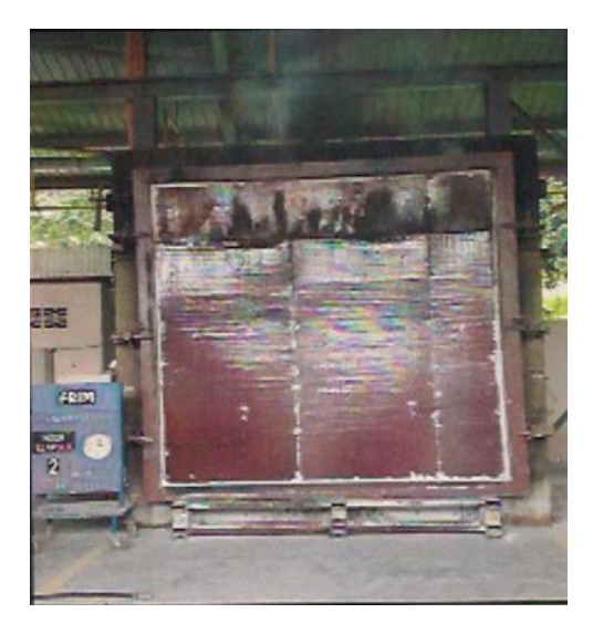
Plate 5. During the test. (Time taken: 120 mins).