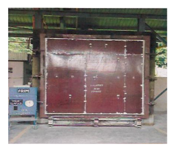
Plate 2: Before the test. (Time taken: 0 mins)