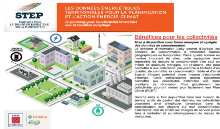
Figure: The benefits of Data-Linky as energetic transition tools for local government (l'Ademe, 2013)

In some discourses delivered by the SEL instigators, big data from Linky could perform as the new model of climate-energy quantification by replacing the old model. We confess under the radar of such self-declaration, most of the stakeholders and eventually the scholars are on a big debate. As explained by Garnier and Lecler (2015), the tools (Linky) are the designed by product that could only induce certain changes of consumerism performances without sharing other variety of significance on energy sobriety. After all, Linky were originally meant to be the supporting tools to consumers awareness. Hence, how Linky could quantitatively contribute to reduce energy consumption or to be a sustainable one needed to be assessed carefully in the future research. It seems too premature to cage the power of big data since very few scientific discussions have approved on how it comes to play.