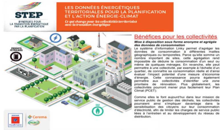
Figure: The benefits of Data-Linky as energetic transition tools for local government (l'Ademe, 2013)

In some discourses delivered by the SEL instigators, big data from Linky could perform as the new model of climate-energy quantification by replacing the old model. We confess under the radar of such self-declaration, most of the stakeholders and eventually the scholars are on a big debate. As explained by Garnier and Lecler (2015), the tools (Linky) are the designed by product that could only induce certain changes of consumerism performances without sharing other variety of significance on energy sobriety. After all, Linky were originally meant to be the supporting tools to consumers awareness. Hence, how Linky could quantitatively contribute to reduce energy consumption or to be a sustainable one needed to be assessed carefully in the future research. It seems too premature to cage the power of big data since very few scientific discussions have approved on how it comes to play.