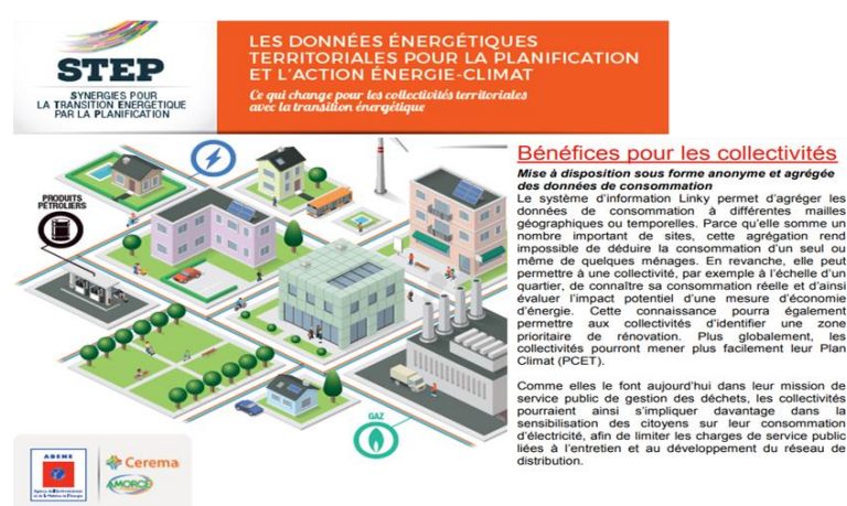
Figure: The benefits of Data-Linky as energetic transition tools for local government (l’Ademe, 2013)

In some discourses delivered by the SEL instigators, big data from Linky could perform as the new model of climate-energy quantification by replacing the old model. We confess under the radar of such self-declaration, most of the stakeholders and eventually the scholars are on a big debate. As explained by Garnier and Lecler (2015), the tools (Linky) are