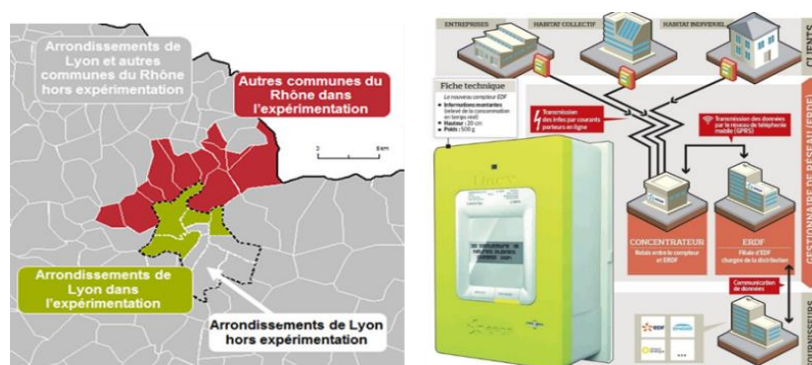
Figure: Lyon as the first metropolis to demonstrate Linky in 2008-2009 (l'Ademe, 2013)