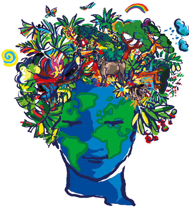
Fig. 1 Vibrant and innovative local-specific human-driven systems as engine for a profound food system transformation. Illustrates the profound food system transformation that is required to achieve the 2030 Agenda on Sustainable Development and the Paris Agreement on Climate and that is made of four parts (nutritious and healthy food, sustainable agricultural production and food value chains, mitigation of climate change and resilience, renaissance of rural territories). Such a transformation relies on the capacity to design and implement local specific innovation based initiatives to address local and national expectations through diverse adapted pathways. It also depends on the capacity to stimulate such initiatives and to orchestrate such a transformation at the global level to ensure orientation and consistency among scales

links with production, value chains, the environment, nutrition, and health (Porter et al. 2014). Sustainable and nutrition-sensitive food consumption patterns should be supported through favorable food environments (HLPE 2017b). Dietary changes and reductions in food wastage are core elements of the SDG for sustainable consumption and production (goal 12) and, more broadly, of all SDGs.