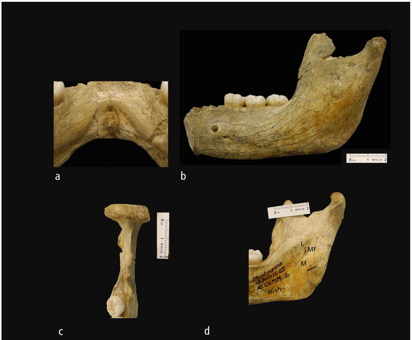
Fig 2. Different morphological aspects of the Montmaurin-LN mandible. a) Internal aspect of the symphysis, showing the fossa genioglossa; b) Left view of the mandible. Note the receding wall of the symphysis, the position of the mental foramen, the flat surface of the corpus and ramus, and the regular gonion profile; c) Detail of the mandible showing the medial position of the mandibular notch rim on the condylar process; d) Internal aspect of the right ramus. Note the low position of the mylohyoid line with regard to M3, the small but almost horizontal geometry of the retromolar area, the presence of a medial pterygoid tubercle (arrow), mandibular foramen (MF), the lingula (L), or the large distance between the end of the mylohyoid groove (MG) and M3. Scale bar in b, c, and d, is 2 cm.

https://doi.org/10.1371/journal.pone.0189714.g002