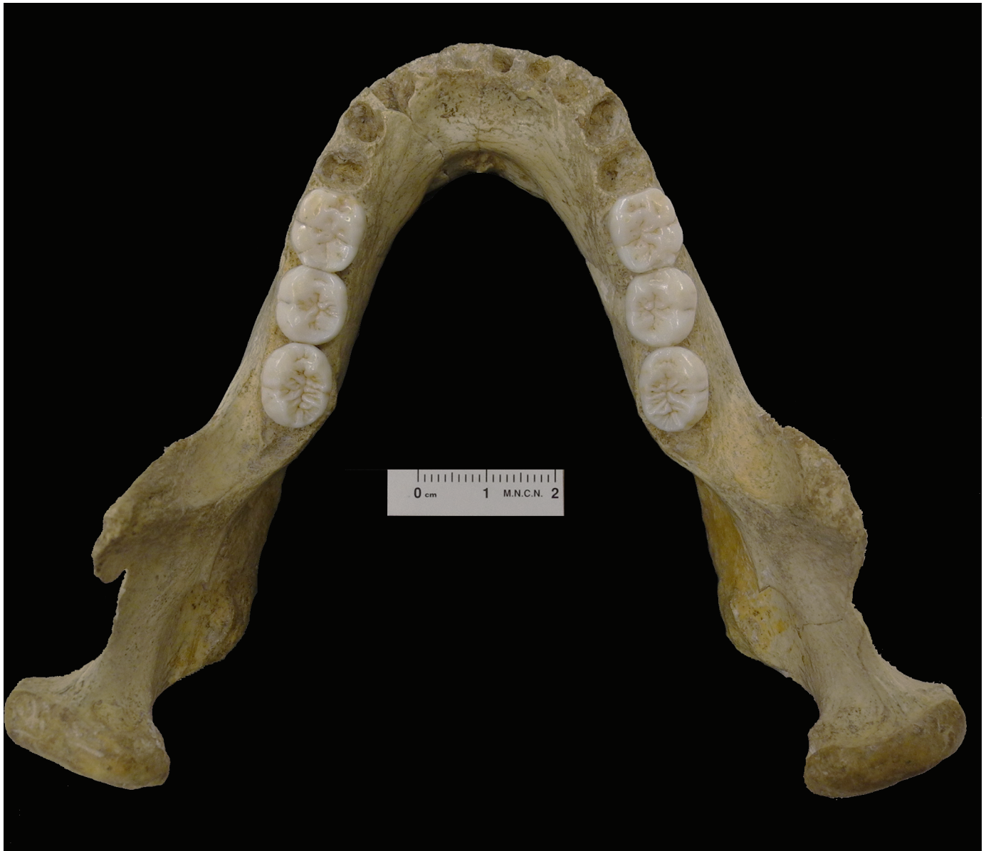
Fig 1. Upper view of the Montmaurin-LN mandible.

https://doi.org/10.1371/journal.pone.0189714.g001