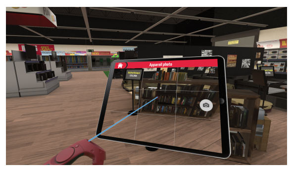
Figure 3: The camera application.

One advantage of VR is data gathering (traces). We are currently using the Bowman et al. (2001) classification to sort out the interactions made by the user: manipulation, selection, navigation and system control. The tablet is too advanced to be considered as a simple manipulation or selection. The system control is the category that is mostly compatible with the tablet. Bowman defines the system control as "a task in which a command is applied to change either the state of the system or the mode of interaction". The tablet behaves in a similar way as described by Bowman, but some applications cannot be included in the system control. For example, the camera application does not change the mode of interaction or the state of the system. It is just a selection in this case, on the contrary to the inventory application that will change the mode of interaction when selecting an object. Thus, the tablet includes all types of interactions, and a deeper investigation is needed to find a correct categorization of the device. A potential category may be "Functionality selection" as the tablet allows the user to select several features.