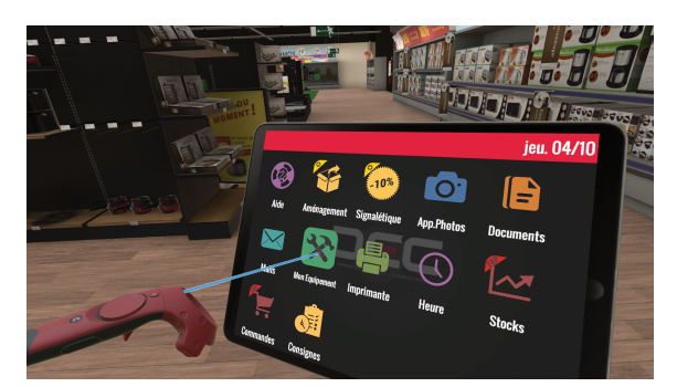
Figure 2: The home menu of the tablet.

The constraints encountered while creating the VR training application drives us to consider new ways of guiding and assisting the user. This idea came from the observation of some virtual tasks. Some tasks like printing a document have low pedagogical interest and cost a huge amount of time. Indeed, the user need to go to the printer, print the document and then return to the right location to continue the task. A floating 3D UI would appear above the printer. The learner had to select the document to print and then