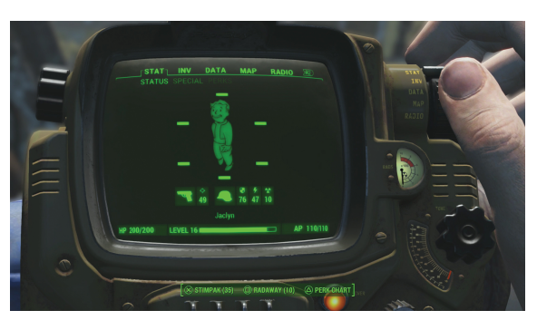
Figure 1: Example of a diegetic interface in the game Fallout4.

A positive aspect of diegetic interfaces, is that they tend to improve feelings of immersion (Raffaele et al., 2017). In their work, Raffaele et al. (2017), investigated the relations between immersion and virtual interfaces through VR. Their results indicate that the user will receive feedback from the UI without being conscious about it and not noticing how feedback is received. For 3D UI, not noticing the feedback source is pointed out as the key to keeping the immersion level high. Consequently, in our training context, it