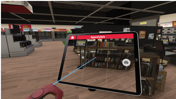
Figure 3: The camera application.

One advantage of VR is data gathering (traces). We are currently using the Bowman et al. (2001) classification to sort out the interactions made by the user: manipulation, selection, navigation and system control. The tablet is too advanced to be considered as a simple manipulation or selection. The system control is the category that is mostly compatible with the tablet. Bowman defines the system control as "a task in which a command is applied to change either the state of the system or the mode of interaction". The tablet behaves in a similar way as described by Bowman, but some applications cannot be included in the system control. For example, the camera application does not change the mode of interaction or the state of the system. It is just a selection in this case, on the contrary to the inventory application that will change the mode of interaction when selecting an object. Thus, the tablet includes all types of interactions, and a deeper investigation is needed to find a correct categorization of the device. A potential category may be "Functionality selection" as the tablet allows the user to select several features.