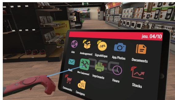
Figure 2: The home menu of the tablet.

The constraints encountered while creating the VR training application drives us to consider new ways of guiding and assisting the user. This idea came from the observation of some virtual tasks. Some tasks like printing a document have low pedagogical interest and cost a huge amount of time. Indeed, the user need to go to the printer, print the document and then return to the right location to continue the task. A floating 3D UI would appear above the printer. The learner had to select the document to print and then