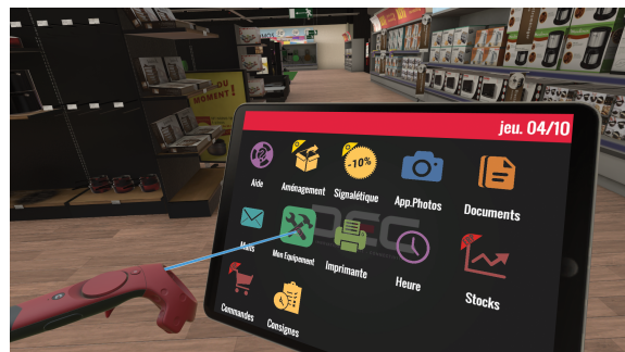
Figure 2: The home menu of the tablet.

The constraints encountered while creating the VR training application drives us to consider new ways of guiding and assisting the user. This idea came from the observation of some virtual tasks. Some tasks like printing a document have low pedagogical interest and cost a huge amount of time. Indeed, the user need to go to the printer, print the document and then return to the right location to continue the task. A floating 3D UI would appear above the printer. The learner had to select the document to print and then