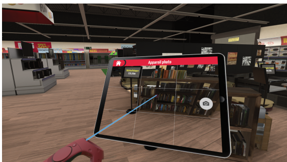
Figure 3: The camera application.

One advantage of VR is data gathering (traces). We are currently using the Bowman et al. (2001) classification to sort out the interactions made by the user: manipulation, selection, navigation and system control. The tablet is too advanced to be considered as a simple manipulation or selection. The system control is the category that is mostly compatible with the tablet. Bowman defines the system control as "a task in which a command is applied to change either the state of the system or the mode of interaction". The tablet behaves in a similar way as described by Bowman, but some applications cannot be included in the system control. For example, the camera application does not change the mode of interaction or the state of the system. It is just a selection in this case, on the contrary to the inventory application that will change the mode of interaction when selecting an object. Thus, the tablet includes all types of interactions, and a deeper investigation is needed to find a correct categorization of the device. A potential category may be "Functionality selection" as the tablet allows the user to select several features.