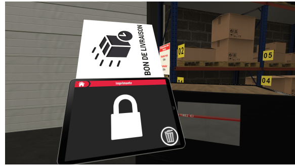
(b) Waiting for the user to take the printed document