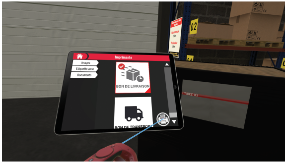
(a) Document selection