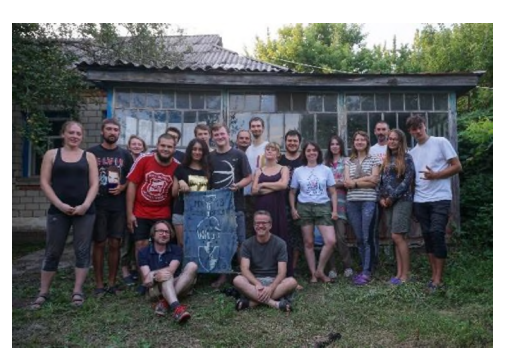
Fig. 34. Participants of the Mezhyrich International Archaeology Summer School.

A separate part of our activities consisted of excursions in the vicinity of the Mezhyrich site in archaeological study order the and palaeoecological context: archaeological prospection of the surrounding area; review of collections of Pleistocene faunal remains from the "Tarasova Hora" National Reserve and the Kaniv Historical Museum; visit the mammoth bone dwelling remains of the Epigravettian Dobranichivka site preserved in situ in a museum.