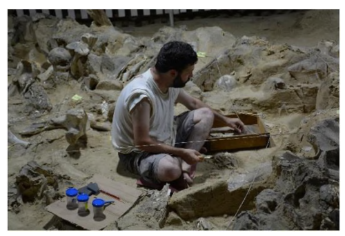
Fig. 32. Working with the bones of fourth dwelling construction.

and chrono-stratigraphical setting of the cultural the palynological, microcharcoal. lavers. microfauna and malacofauna content, the zooarchaeological interpretation of the mammal bone material, and typo-technological features of the lithic industry. Mezhyrich is a unique site for conducting both research and for teaching the application of different natural science methods in archaeology within the context of an International Archaeology Summer School: because of a precisely described loess stratigraphy, the very well preserved cultural layers have been yielding representative collections of lithic and osseous artefacts, made of bone, ivory and antler, and faunal remains (Fig. 32).