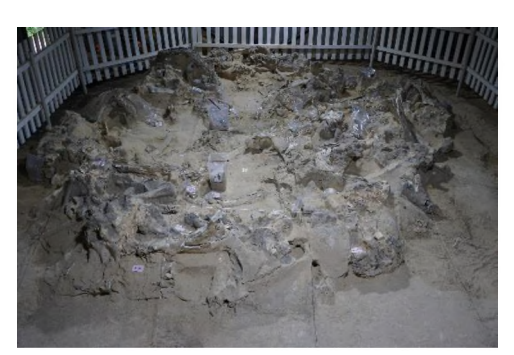
Fig. 33. Mezhyrich. The fourth mammoth bone dwelling.

students during the summer school, which took place from 15 to 30 July.