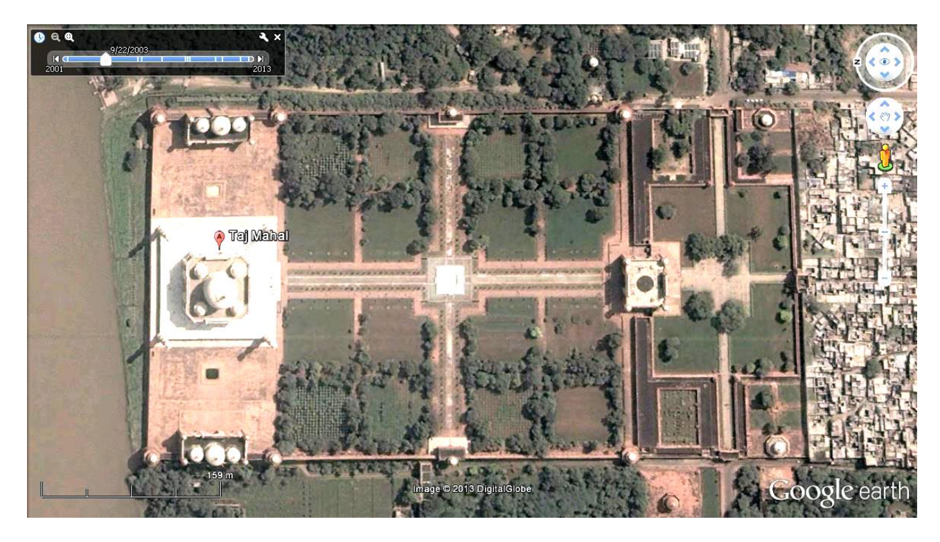
Figure 2 – The Taj Mahal Gardens. Note that the image is rotated: the mausoleum, gardens and gateway are aligned in the North-South cardinal direction.

According to Ref.10, most Mughal charbaghs are rectangular with a tomb or pavilion in the center. The Taj Mahal garden is unusual because its main element, the white Mausoleum, is located at the end of the garden. This fact created a debate amongst scholars regarding the reasons why the traditional charbagh form had not been used. Ebba Koch suggests that a variant of the charbagh was employed; that of the more secular waterfront garden found in Agra, adapted for a religious purpose [10,14]. However, after the discovery of the Moonlight Garden, on the other side of the River Yamuna, the Archaeological Survey of India proposed that the Yamuna itself was incorporated into the planning of Taj Mahal, to be seen as one of the rivers of Paradise. In this case, the Taj Mahal complex, as shown in the Figure 1, becomes the traditional charbagh [10].