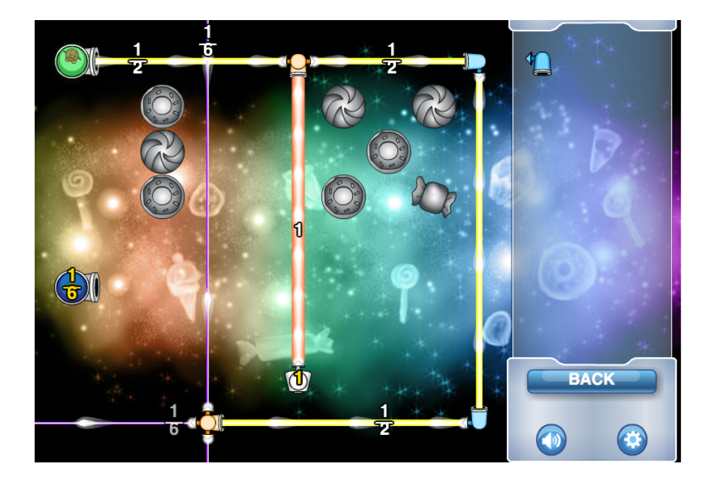
Fig. 1 Refraction: a puzzle game to learn fractions

With games, learning occurs through interactions with objects, places and other people (collaborative learning). Finally, emotion is another important pedagogical factor. The universe and the narration of the game contribute to engage learners by making them feel emotions. Game-based learning is definitely a powerful means to take into account the game and digital culture of the new generation of learners, characterized by a relatively short attention span and a preference for exploration and discovery.