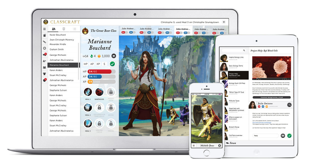
Fig. 2 Classcraft, a platform to gamify classroom activities

leaderboards, object collection, ... A good example of gamification is Classcraft , a platform to gamify classrooms (Fig. 2). With Classcraft , teachers and students play together in the classroom a role-playing game. Students can level up, work in teams, and earn powers that have real-world consequences (e.g. switch seats, choose the order during presentations, ...).