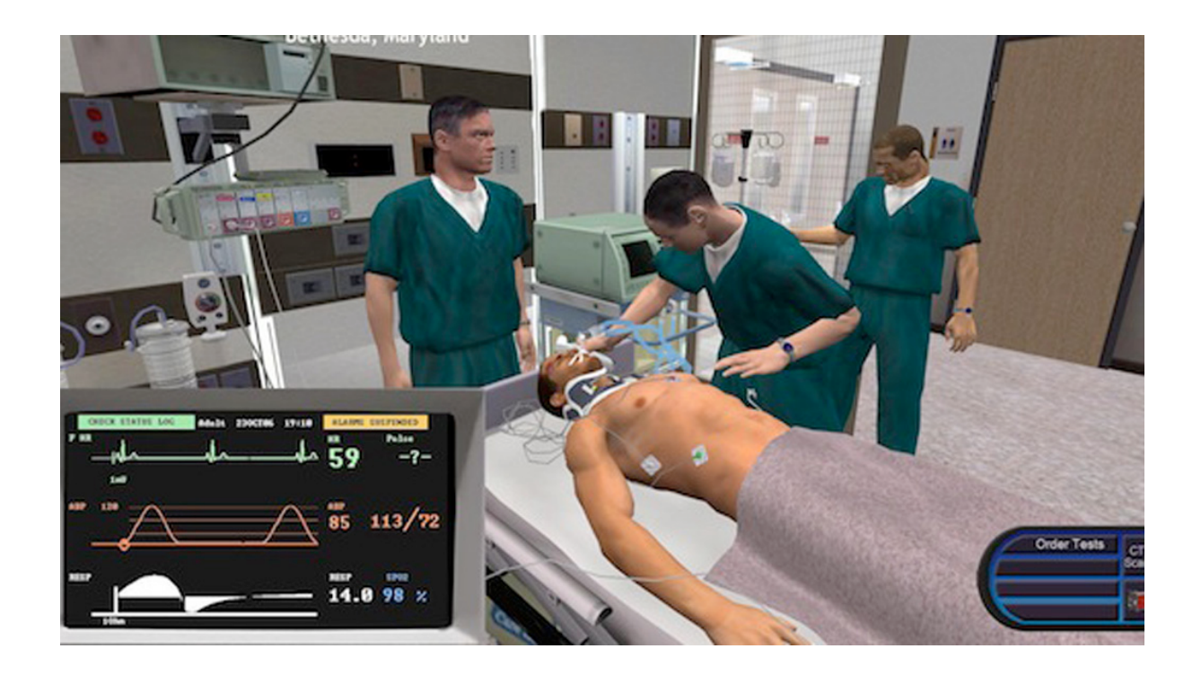
Fig. 4 Pulse!! a simulation-based learning game for health care professionals

Nevertheless, the situation does not necessarily need to be realistic in a serious game: metaphorical situations can also lead learners to build skills. For instance, a fiction science scenario can help to learn concepts in sustainable energy. The skills developed can be meaningful for learners even in an imaginary situation, far from reality. There is no need to have a model to reproduce situations realistically; the game can be based on a predefined scenario.