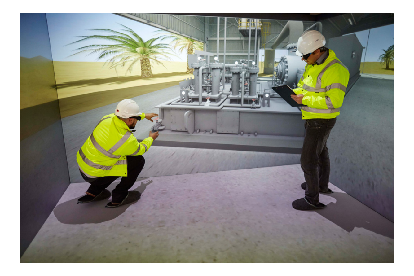
Fig. 3 Training of operators in a CAVE (iCube) with the environment I3TE

By definition, virtual reality applications are often based on a simulation. Immersion of the learner can greatly facilitate situational learning. Nevertheless, the fact of using virtual reality is not enough to ensure learning, just as visual fidelity is not a guarantee of pedagogical effectiveness (Bossard et al. , 2008). A reflection must be made both on the didactic situations and on the scenario. Again, gaming scenarios can be used to motivate the player to improve skills. As discussed further, research questions remain in this field.