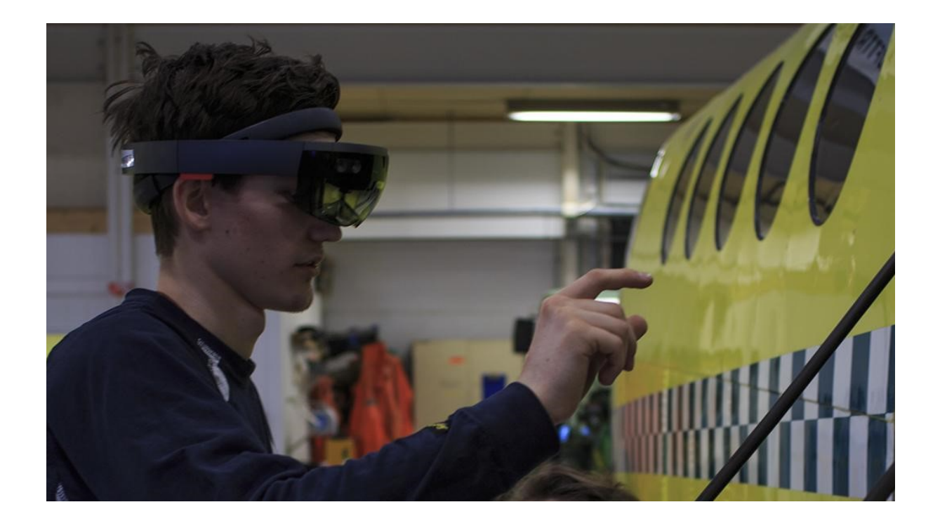
Fig. 4 Aircraft maintenance training with the use of AR technology in the wekit project

world with virtual content to create an immersive environment placing the learner in realworld context and engaging all senses (Bacca et al. , 2014). More generally, Mixed Reality (MR) was defined as a continuum between real world and virtual world (Milgram and Kishino, 1994). The objective is to enrich a situation based on the real wolrd or add realism in a virtual environment. This objective can be achieved using many devices such as screens, cameras, see-through glasses, mobile devices and tactile or tangible interfaces. Some research on the integration of mixed reality interactions into educational applications have highlighted their potential, mainly to improve the anchoring of learning and positioning learners in authentic situations (Egenfeldt-Nielsen, 2006). For example, the wekit project aims at experimenting new forms of interaction for professional training (Fig. 4). The idea consists in capturing expert experience and sharing it with trainees during task-sensitive augmented reality. A pilot study is currently conducted in the field of aircraft maintenance in order to present data in context and augment performance (Guest et al. , 2017).