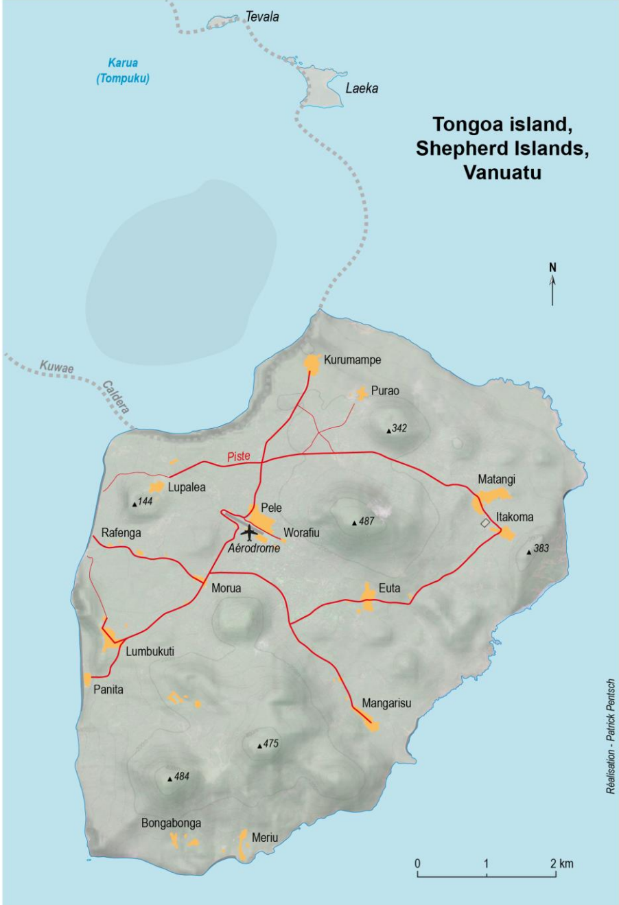
Figure 2: Map of Tongoa island

Besides volcanic risks, the island of Tongoa is also exposed to other types of disruptive events, such as cyclones, landslides, earthquakes, droughts, etcetera. Interestingly, there is however, no word in the vernacular languages that corresponds strictly to the notion of catastrophe. This does not mean that a disruptive episode with lasting consequences cannot be