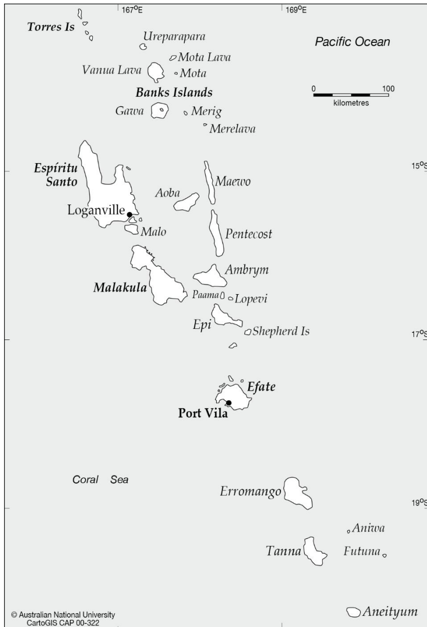
Figure 1 : The major islands of Vanuatu

Tropical Cyclone Pam, a category 5 event, was the most severe climatic event recorded in the South Pacific for several decades. With winds gusting at over 350 km it devastated much of the Vanuatu archipelago, located in the South Pacific, from 12-14 March 2015 (Leone et al. 2015). Tongoa was one of the worst-hit islands of the archipelago. Torrential rains, rough seas and high winds devastated the landscape and livelihoods; the shore was covered with a thick layer of eroded soil, the vegetation was stripped of its leaves, the subsistence gardens were wrecked, and most houses were damaged. However exceptional this cyclone might have