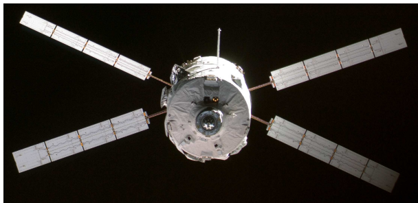
Figure 3: ATV Jules Verne, during its rendezvous with the ISS, on the 3 rd of April 2008

The interest of the ASN.1 data modelling language and of the associated tools (code and ICD generators) has been assessed by Astrium by retro-engineering a part of the ATV (Automated Transfer Vehicle) program.