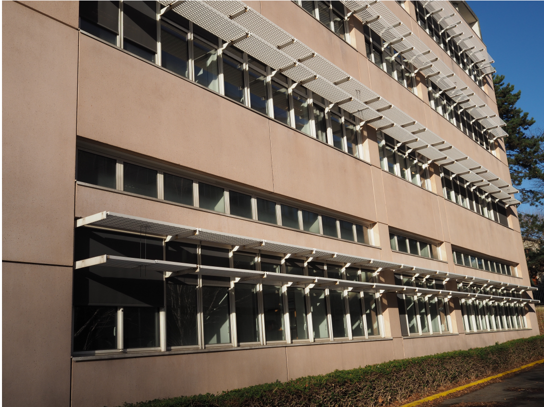
Figure 2: Reference image of size 4608 \times 3456 used for the experiments of Section 4. It contains flat areas, regions with different levels of textures and sharp edges. In all the experiments this image is shifted by (0.5, 0.5) with half-symmetric border condition.

All results (precision and running time) of this section are computed on a reference 4608 \times 3456 image (shown on Figure 2), a shift of (0.5, 0.5) and with half-symmetric border condition. The reference image contains flat areas, regions with different levels of textures and sharp edges.