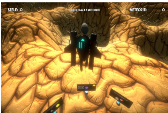
Figure 2. The player on a surface of Venus (Final Frontier game part 1).

The game supports two learning modules: through game levels ( Erreur ! Source du renvoi introuvable. ), tasks/problems to be solved and quizzes per level to be completed; or through a virtual, interactive, library ( Erreur ! Source du renvoi introuvable. ) that exists on the spaceship describing the concepts to be learned about the planets and the solar system. Once the player completes the tasks for a given level, they must complete a puzzle that assesses the acquired knowledge. If they get it right they