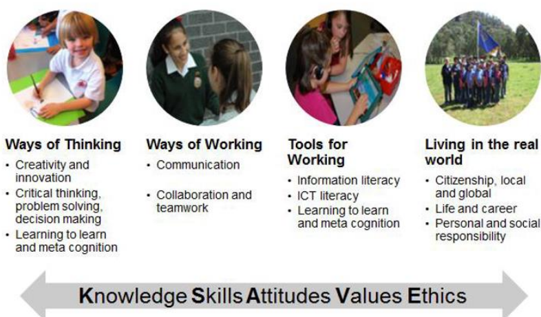
Figure 1. KSAVE Framework [5]

The Assessment and Teaching of 21 st Century Skills (ATC21S) project [5] develops a framework consisting of a hierarchy of skills that play a pivotal role in collaborative problem solving. Due to the role of technology in the workplace and life styles, new skills were needed as well as new emphases on older skills.