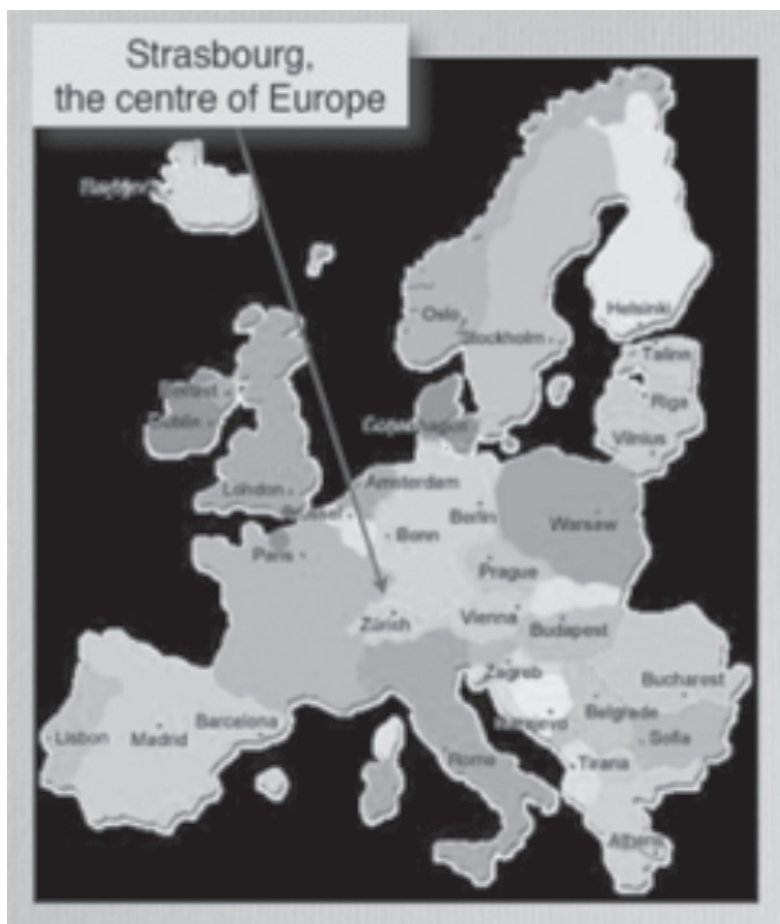
Figure 5. Last slide of the Nobel Lecture given by Jean-Pierre Sauvage, Stockholm, 8 December 2016. Available at https://www.nobelprize.org/prizes/chemistry/2016/sauvage/lecture/ .

The influence of local conditions and the special place of Strasbourg are tangible in this historical reconstruction of the emergence of SMC in France. In the quotes above, we see how chemists in Strasbourg stressed their commitment to a European “publication infrastructure”. In concluding his Nobel Lecture in Stockholm, Jean-Pierre Sauvage placed Strasbourg at the center of Europe.