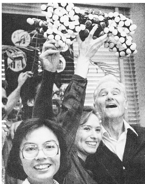
Figure 2. Cram and colleagues (one brandishing a CPK model) at the announcement of the Nobel Prize in 1987

In their definition, hosts were synthetic counterparts of the receptor sites of biological chemistry, and guests, the counterparts of substrates, inhibitors, or cofactors. Cram and colleagues designed and prepared more than 1,000 hosts, each with unique chemical and physical properties (Cram and Cram 1994). Cram underscored the importance of visualization and the use of Corey-Pauling-Koltun (CPK) molecular models: