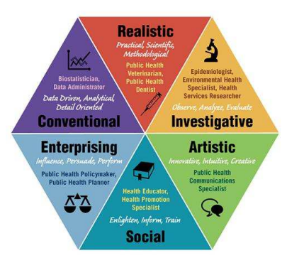
Figure 1. Holland types

Several models addressing career decision making and learning exist. The Holland Codes or the Holland Occupational Themes (RIASEC), is a theory of careers and vocational choice based upon personality types [8]. This theory is the best known and most widely researched. There are six basic types of work environment: Realistic, Investigative, Artistic, Social, Enterprising, and Conventional (cf. Fig. 1). People consider environments where they can use their skills, abilities and values. For example, Investigative types are more looking for a problem-solving environment. People who choose to work in an environment similar to their personality type are more likely to be satisfied. A hexagonal model (figure 1) shows the relationship between the personality types and environments. Choosing a career or education program that fits Holland personality should be a vital step toward career well-being and success—job satisfaction.