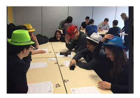
Figure 5. Jobs, activity sectors, localisations and joker to imagine a good to best job.

consequences (peer learning), take information and plan individual actions. Collaborative and active (cf. Figure 4), this workshop has two advantages: (i) to take the professional decision and (ii) to discover a solving problem method, in a same time. Each student wears one hat with a specific colour. The white hat gives the factual point of view, the yellow hat speaks about the benefits and advantages, the black hut speaks about the difficulties and risks, the green hut shows the opportunities, the red hut is feeling and emotional intelligence, the blue hut is the rational thinking. With this 360 degree vision, the professional project target could be approved or not.