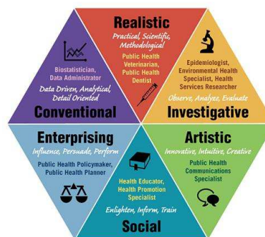
Figure 1. Holland types

Several models addressing career decision making and learning exist. The Holland Codes or the Holland Occupational Themes (RIASEC), is a theory of careers and vocational choice based upon personality types [8]. This theory is the best known and most widely researched. There are six basic types of work environment: Realistic, Investigative, Artistic, Social, Enterprising, and Conventional (cf. Fig. 1). People consider environments where they can use their skills, abilities and values. For example, Investigative types are more looking for a problem-solving environment. People who choose to work in an environment similar to their personality type are more likely to be satisfied. A hexagonal model (figure 1) shows the relationship between the personality types and environments. Choosing a career or education program that fits Holland personality should be a vital step toward career well-being and success–job satisfaction.