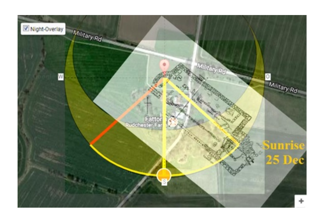
Figure 3: Using the two images from Figure 2, we can compare the direction of the axis of the temple and of the sunrise at Rudchester on December 25. The alignment seems quite good.

As a conclusion, we can tell that we have two Mithraea, close to the Hadrian's Wall, which have, through their orientation, a link to the winter solstice and therefore to December 25, the day of the birth of Mithras. Let us also observe that astronomical orientations, in particular orientations along sunrise/sunset on the solstices, were used by the Romans in the planning of military forts and colonies (see for instance, [9-15]). For this reason, the fact that the Mithraea of Brocolitia and Rudchester have, more or less, the same astronomical orientation seems more than a coincidence.