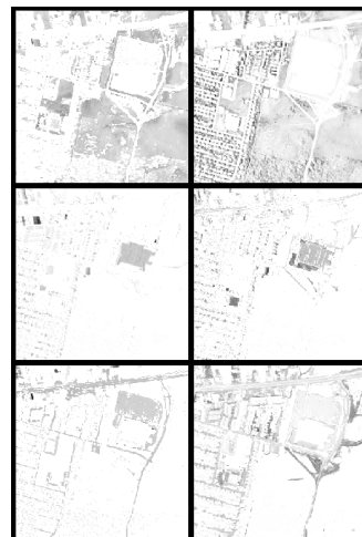
Fig. 3. Abundance maps extracted by ESNA on the Urban HSI. From left to right, top to bottom: grass, trees, roof tops 1 and 2, road, dirt.

band. Noisy bands were removed beforehand. It is a rather simple and well understood data set: it is mainly composed of r = 6 types of materials (grass, trees, two types of roof tops, road and dirt) as reported in [26]. The scene represents a walmart, its parking lot and the surrounding area (it can be found on Google maps with the keywords “copperas cove texas walmart”). In the K-NMF model, each column of the matrix M \in \mathbb{R}^{162 \times 94249} is the reflectance spectrum measured for a pixel, each column of D \in \mathbb{R}^{162 \times 6} is the spectral signature of a pure material and each column of B \in \mathbb{R}^{6 \times 94249} gives the abundance of the pure materials in the corresponding pixel. This HSI has relatively high spatial resolution hence most pixels contain no more than two materials so that using k = 2 makes sense. ESNA gives a solution with relative error \frac{\|M - DB\|_F}{\|M\|_F} = 5.08\% which, in this case, performs better than NOLRAK with relative error of 7.91%. Fig. 3 displays the abundance maps (the matricized rows of B ) which localize the pure materials relatively well.