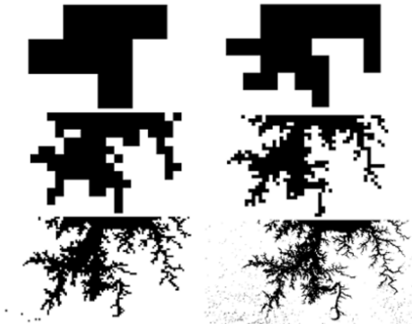
Figure 2: Using the Pixelize filter of GIMP we have a series of binary images that we use for evaluating the fractal dimension of the coastline.

Using GIMP, the GNU Image Manipulation Program, and in particular its Pixelize filter ( https://docs.gimp.org/2.6/en/plugin-pixelize.html ), we can render the image in the Figure 1 as a series of images composed by large color blocks. Figure 2 shows them in binary images, made of black blocks in a white background. Therefore, by means of GIMP, we have a series of binary images suitable for the experimental evaluation of the fractal dimension of the coastline. Our “sticks” are the sizes of the blocks in the Pixelize filtered images.