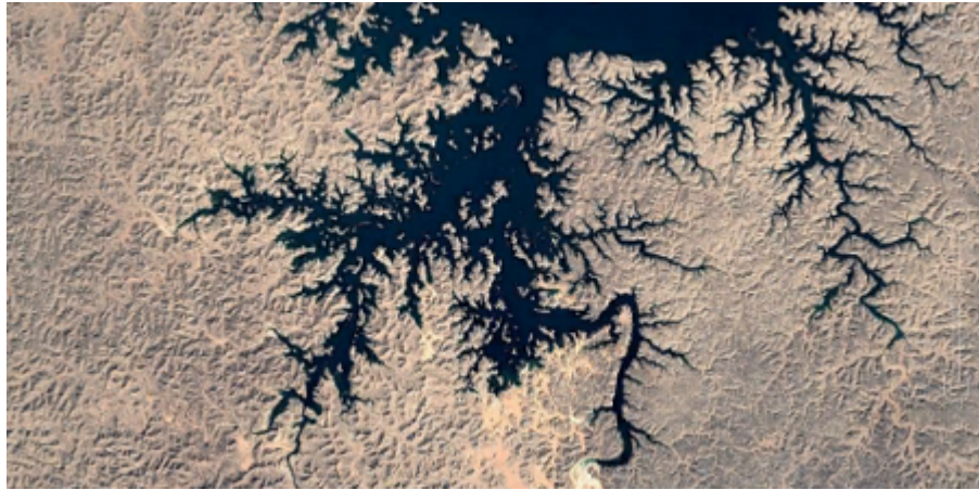
Figure 1: A part of Lake Nasser in Google Earth imagery.

previous article [11], we considered this lake for giving a recurrence plot of its level from altimetric data).