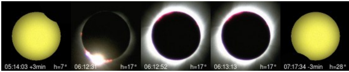
Figure 3: Graphical chart of the total eclipse of 188 BC seen from Rome.