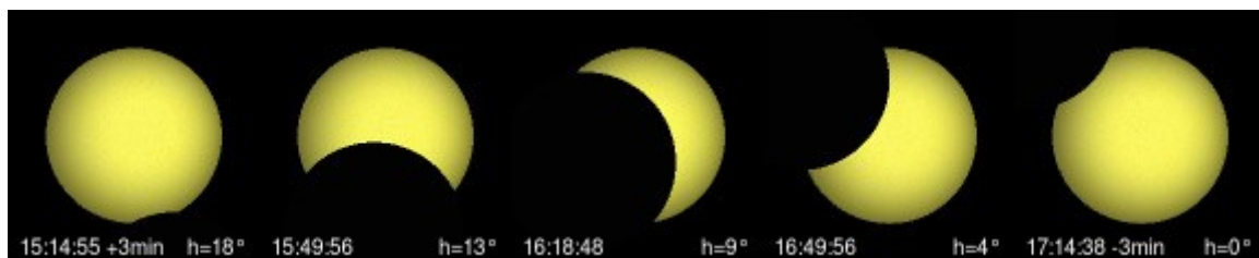
Figure 7: Graphical chart of the partial eclipse of 217 BC seen from Arpi.

One of the omens was the eclipse seen in Arpi, near Foggia. So let us use CalSKY for that location. We have the following eclipse. 11 February 217 BC: Partial Solar Eclipse, Saros-Number: 56, Obscuration=60.995%, Altitude=8.8°, Azimuth=240.6° WSW, Duration of eclipse=2h00m, ET-UT=12984.8sec.