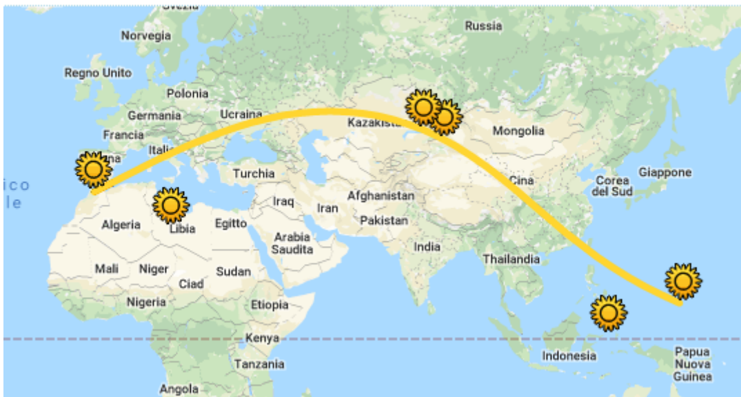
Figure 5: Thanks to CalSKY we can also see the path of the solar eclipse of 188 BC.