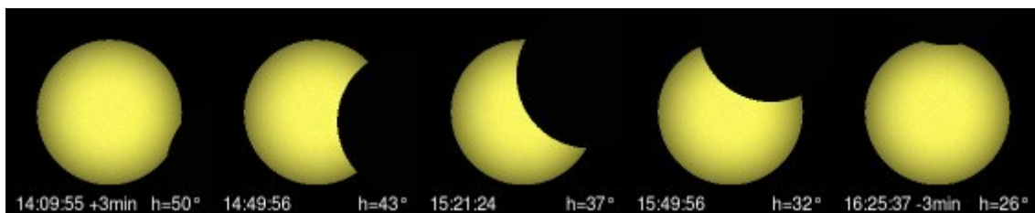
Figure 1: Graphical chart of the partial eclipse of 203 BC seen from Cuma. “At Cumae the orb of the sun seemed diminished”.

As we did in [7], for the study of the lunar eclipse of Alexander, let us use software CalSKY, a web-based astronomical calculator, created by Arnold Barmettler, University of Zurich. Let us use Cuma (Bacoli) as location to observe the eclipse. We find that on 6 May 203 BC, we had a Partial Solar Eclipse, Saros-Number: 54, Obscuration=37.070%, Altitude=37.4°, Azimuth=257.3° WSW, Duration of eclipse=2h16m, ET-UT=12809.7sec. The software gives us also the possibility to have a graphical chart, here shown in the Figure 1.