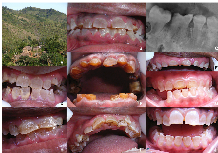
FIGURE 2 | Clinical description of the disease. (A) The remote village of Antananarivo. (B–J) Inhabitants' dentition showing the typical features of dentinogenesis imperfecta with the gray-brown discoloration of the dentin clearly visible after enamel cleavage and progressive tooth wear. (C) On the retro-alveolar radiography of the lower right premolar/molar sector of individual (B), cervical constriction, short roots and the disappearance of pulp spaces due to erratic dentin formation represent the characteristic hallmarks of dentinogenesis imperfecta. (H–J) In addition to dentin anomalies, hypoplastic enamel defects exist, with the presence of pits, striae and flattened buccal surfaces.