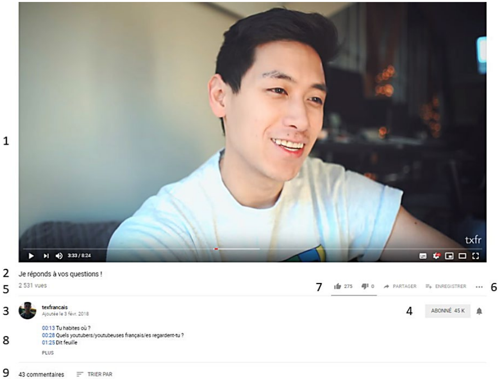
Figure 10.1 Techno-semio-discursive space of a vlogger on YouTube. Link: https://www.youtube.com/watch?v=9A54ESetlYQ .

Barton and Lee (2013) point out the importance of YouTube's comments space: