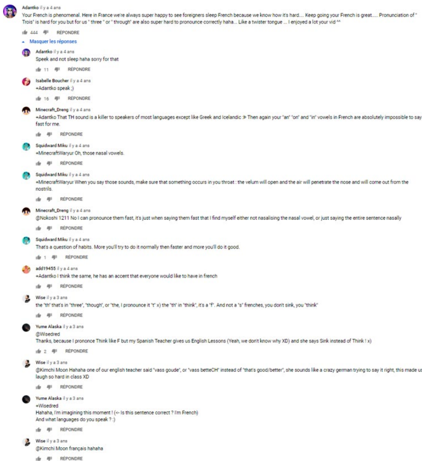
Figure 10.3 Exchanging comments on pronunciation (extract).

It is also interesting to note that from the difficulties of pronunciation in one language, internet users exchange and collaborate on difficulties in other languages, especially English. As internet users communicate in one or more languages, metareflexivity is also much more present. The wide demographic of individuals present on the YouTube platform should also be taken into account. However, it is difficult, given the limited information we have about the vlogger’s interlocutors, to build an understanding, based only on a semio-discursive