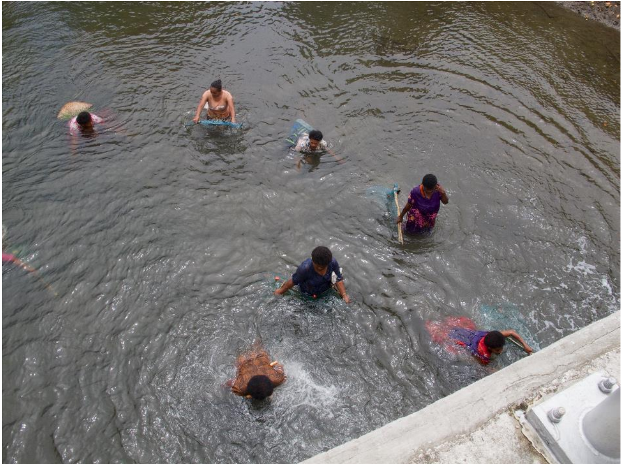
Fig.4: Women passing under the new bridge in Nagigi, Vanua Levu, to meet the Deu or Ki

In these different cases, the local interpretations of the decline of a culturally significant fish or the non-appearance of a seasonal marine invertebrate in the usual coastal or reef fishing grounds are mainly related to: (1) transformations of the physical dimension of the land-sea interface (development of the residential space and of new infrastructures, increasing number of boats); (2) non-compliance with customary and/or religious prohibitions and norms; (3) a lack of harmony in relationships within and/or between social groups. The two last issues imply a twofold punishment: by the fishes themselves and by the Christian God. On the one hand, fishes are not considered as mere objects of human perception and consumption, but as subjects whose behaviours are intrinsically connected to human behaviours: if humans do not behave as they should, individually or collectively, these fishes will know and hide. Some community members, for example, therefore predict such or such fish might not be as abundant as expected during the year or the next one when they consider that their fellows' behaviours are not acceptable by customary and/or religious standards: