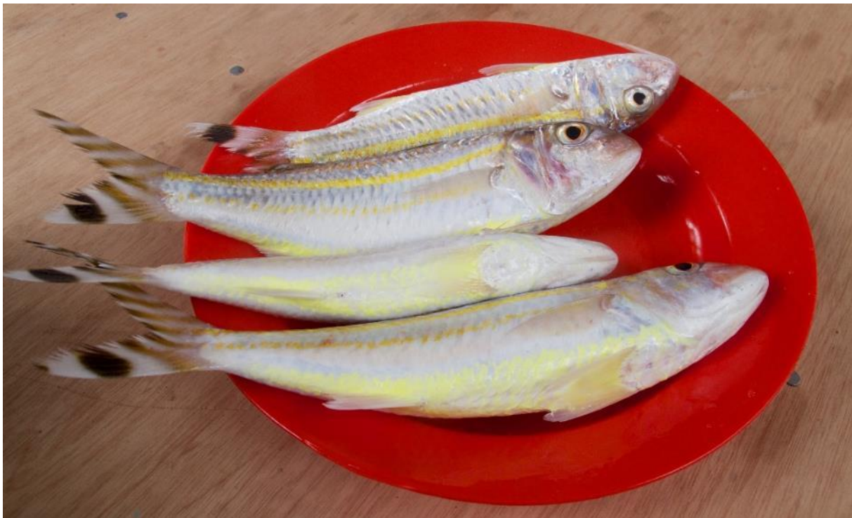
Fig.3: Deu or Ki freshly caught in Vanua Levu’s waters

In Nagigi village on Vanua Levu Island, Deu or Ki (Yellowstriped goatfish, Upeneus vittatus , Mullidae family, cf. Fig.3) is said to have become rare because some people, the year before, ignored their exchange obligations (here again, they sold their surplus instead of sharing it with their relatives), or because a few ate the fish the wrong way (one cannot kill it by biting it and its guts have to be eaten). Others claim this fish has become rare because it is afraid of swimming under the new bridge built as part of the Hibiscus highway (cf. Fig.4) and it is therefore unable to reach its spawning ground. In another village of Vanua Levu, Loa, the villagers explain that one of their culturally significant fishes has not spawned in their waters since they “lent their fish to a neighbour village which had to organize a big feast and to feed a lot of people, [but] unfortunately [...] forgot to return the fish” (group interview, 28 October 2016).