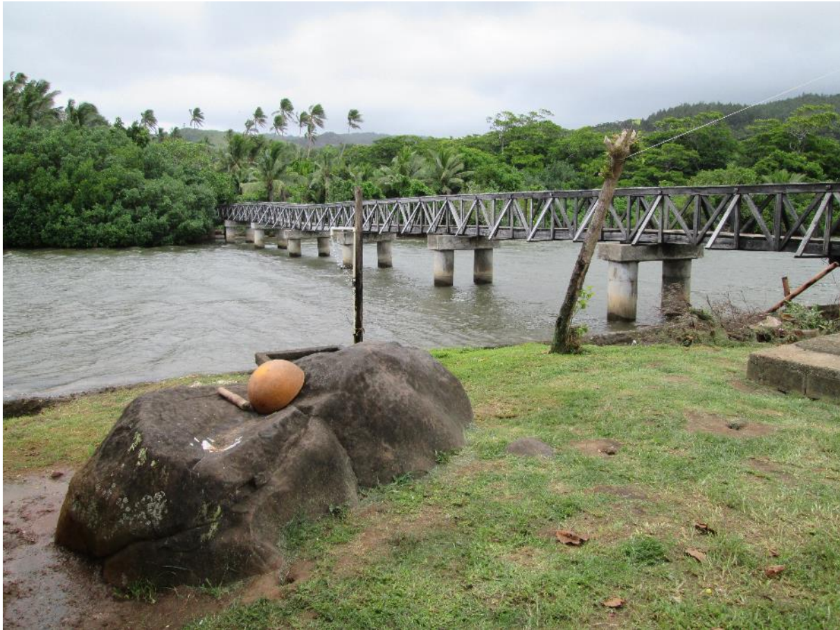
Fig.2: The tip of the “ Tugadra stone”, most of which is now buried near the community hall and the seawall of Malawai village

Such multiple interpretations of marine species dynamics, mixing sociocultural, religious and other registers, are not specific to this case study. For instance, in Nacula village on Nacula Island, Balolo (Palolo worm, Eunice viridis , Eunicidae family) is a delicacy, but its seasonal appearance in October-November is also deemed to enhance future fertility and life of everything on the land (people, animals, plants and food crops, etc.) 10 . The villagers expect the casting off of its epitokous segments and their quick release of gametes in the environment eight days after full moon, but explain that one cannot mention this phenomenon in conversations in the days preceding it, because Balolo would hear this and therefore hide itself. Moreover, the villagers consider that Balolo will not appear, or not in abundance, if there have been recent tensions and conflicts within the village or if, the previous year, after the customary offering to the chief, the surplus of this delicacy was sold instead of being shared with relatives. In case of non-appearance of Balolo , the villagers also refer to context-related conditions, such as wind directions, tide patterns and moon phases, and some even blame the many tourist boats