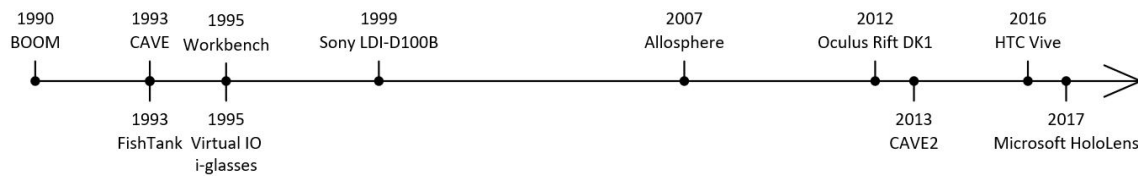
Fig. 2: Timeline of the rendering technologies used to implement immersive analytics system

a keyboard to change visualization parameters, though it broke immersion. Data glove interaction in immersion used electromagnetic field tracking, which required the control of the workspace environment not to disturb the measure, as well as a calibration phase prior to each use.