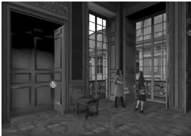
Figure 1 Screenshot from the game Versailles 1685 .