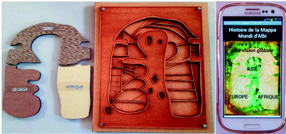
Fig. 1. Sensitive wooden map coupled to an audio description application

Two representations are designed to visual impaired people based on a sensitive wooden card coupled with an application on a smartphone which provides an audio description (Fig. 1), or with an autonomous system which provides a tactile sound feedback to each element. An adaptation of this prototype has permit to deaf people to manipulate and understand the map (description written on the smartphone, name of country visible on the wood, etc.).