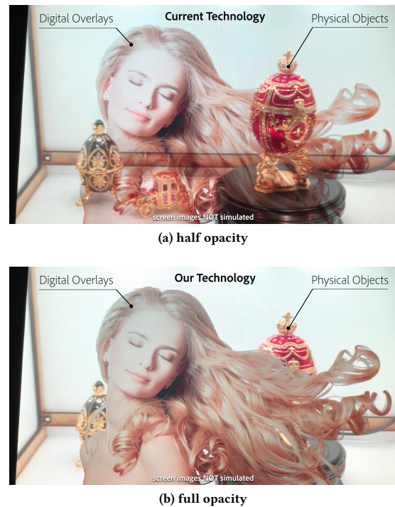
Figure 2: Per-pixel opacity control.

The two-phase composite is generated by alternating between the transparency and color phases at 144 frames per second (fps).