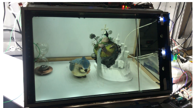
(c) two-phase composite

Figure 1: Our composite display system. The transparency image, (a), displays white to represent transparent areas while black heavily attenuates the view. The color image, (b), displays the color channel over the illuminated diffuser. At 144 Hz, the two-phase composite, (c), occludes physical objects within the display box.