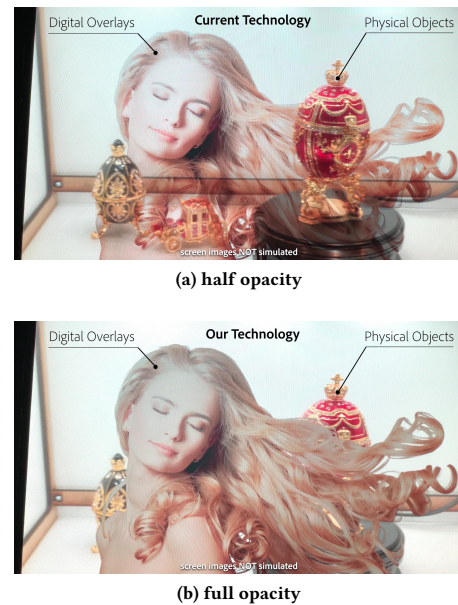
Figure 2: Per-pixel opacity control.

The two-phase composite is generated by alternating between the transparency and color phases at 144 frames per second (fps). This frame rate enables us to display not only static images, but