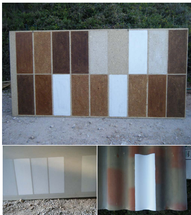
Figure 1: Paints and varnishes with ENPs additives, and paints containing ENPs on wood panel (top), plaster with cardboard (bottom left) and cement plate (bottom right).

in the laboratory using a mixture of commercial sand and gravel, cement (350 kg/m 3 ) and water (8% of the total weight of the mixture). After 28 days of curing, the specimens were removed from the moulds and followed the same treatment as other samples.