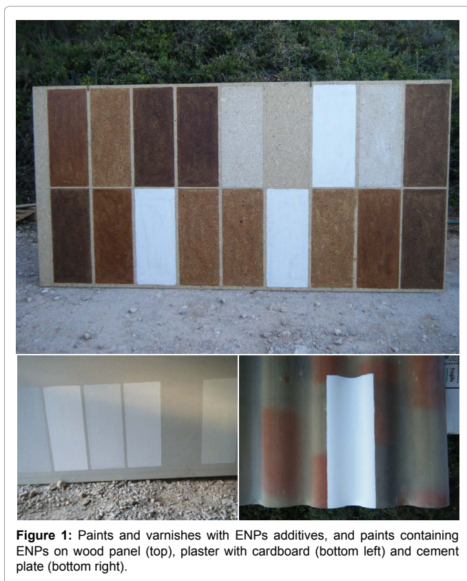
Figure 1: Paints and varnishes with ENPs additives, and paints containing ENPs on wood panel (top), plaster with cardboard (bottom left) and cement plate (bottom right).

in the laboratory using a mixture of commercial sand and gravel, cement (350 kg/m 3 ) and water (8% of the total weight of the mixture). After 28 days of curing, the specimens were removed from the moulds and followed the same treatment as other samples.