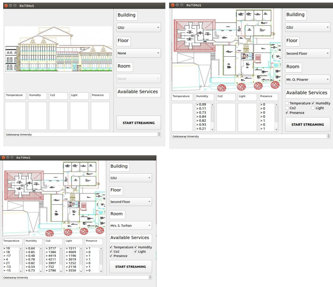
Figure 3. a. Choosing a building from the list. b. After choosing the building and a floor, a reliable plan of the floor is fetched to present the rooms on that floor. In the chosen room, presence and humidity services are available. c. Streaming data from the chosen services

All the deployed sensor devices are virtualized in the 3D model that called the BIM. Via the BIM, the users are not obliged to have knowledge about the sensors or their locations. A user simply chooses the building-floor and the room form where he wants to get information (physical condition). Once the user submits his preferences, system based on the BIM and the sensor data stored in the model, proposes the available services from that room. Finally, the user chooses the available services from the list and the system makes the subscription stands for the retrieving the sensor stream data that goes to database in actual condition. The samples from the developed user interface (in Python 3) are represented in Figure 3.