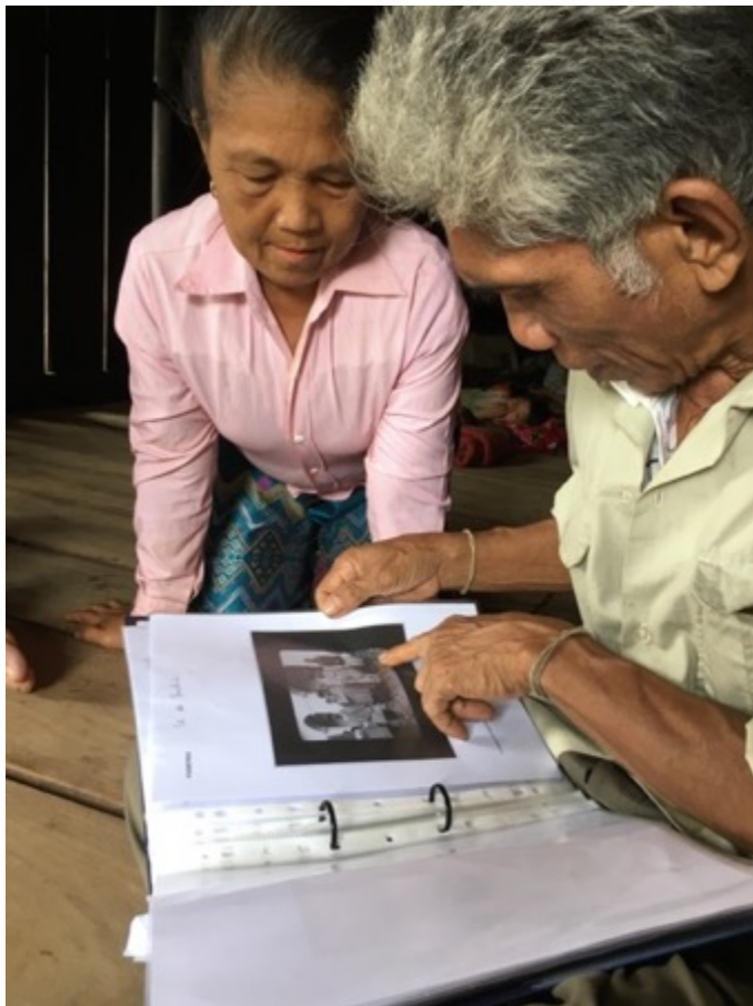
Figure 9: exploring with Khùa household in La Trộng, Dân Hóa commune, 2016.

How did Cuisinier reach the area of Minh Hóa to start exploring this diversity? What were key findings? The planned route first involved visiting Khammoun province in neighbouring Laos to “look for relations between the inhabitants of Kammuôn and the Nguôn”. They planned to enter Laos through Nghệ An and followingly reach Quảng Bình through Khammoun (Laos). The planned route description also contains a description of their planned working method, which is revelatory of the limited contacts in the field. As they indicated how they would approach people upon reaching Latrong village (today a mainly Khùa settlement 22 ).