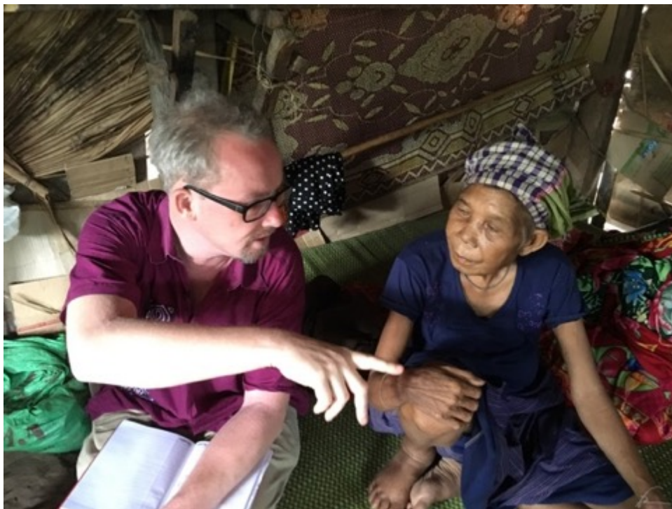
Figure 15: Interviewing Mày descendant about her father in K-Ai, 2016