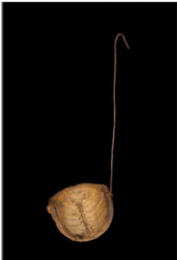
Figure 12:lamp from Quang Ninh (Colani collection) 32

Thus contrary to decades of reproducing ideas of isolation, which would reappear with force in the 1960s, the Cuisinier-Delmas material, and partly indicated earlier by Cadière, demonstrate longstanding histories of engagement and exchange. The material also demonstrated intimate and longstanding indigenous knowledge systems and practices, skills and practices appreciated well-beyond the confines of the immediate community boundaries. Objects are equally intimately tied to the particular environments. This is also evident in parts of the ethnographica sent by Madeleine and Eleonore Colani 31 . Thus one object collected in Quang Ninh province consists of a lamp made from a turtle shell.