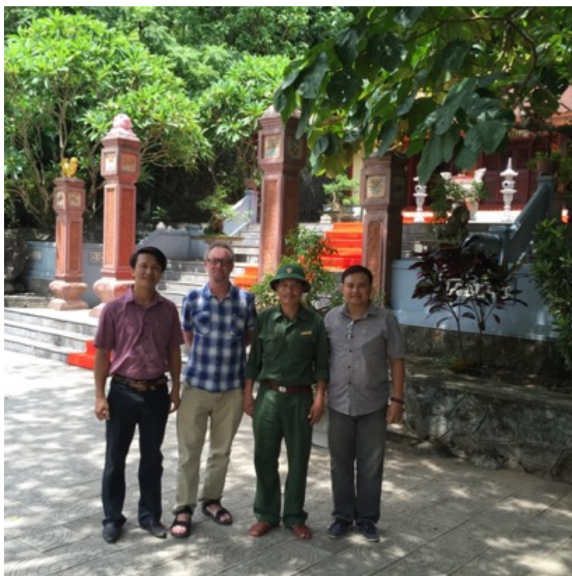
Figure 4: Research team paying their respects at Hang Tam Co, Bồ Trạch district.