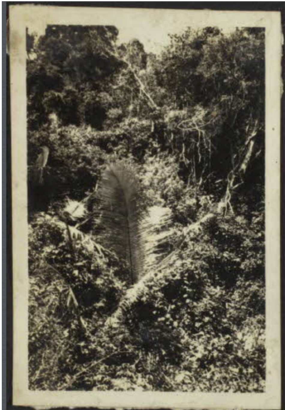
Figure 21: traditional palm among the Ruc. 42

Even a picture described as “luxuriant vegetation” in the museum archives gains further meaning through proper understanding of the specific cultural context. More than simply vegetation, it is the picture of a palm, which culturally plays a critical role in the ways of life and food security of the Rục people. The “Kapac” palm is abundant in the area and continues