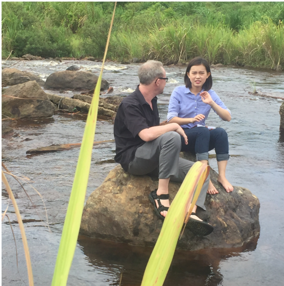
(interview by local television)

The bulk of the work in terms of analysing archival and oral history work and summarizing it in a synthetic manner is the main task now remaining. Results appear significant from a number of perspectives. For one, the whole research process, even if small in scope, has generated substantive interest from the Vietnamese colleagues and wider audiences. I was thus interviewed by local television and the management board is key to see what broader lessons can be extracted about the linkages between natural heritage and cultural diversity.