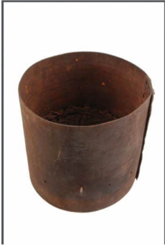
Figure 11: panier de caisson Muong fabriqué par des Ruc (Cuisinier collection) 30

crossbows, resins, lamps, cooking gear and arrows, largely crafted by the Ruc recognized for their excellence, yet widely sought for by neighbouring ethnic groups 29 .