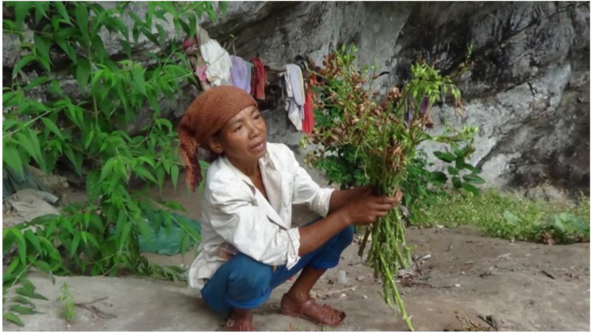
Figure 24: Growing tobacco next to the cave, Thượng Hóa, 2016.