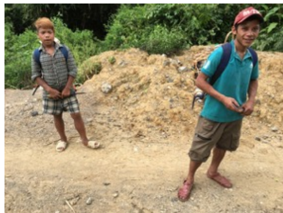
Figure 25: Rục children fishing Figure 26: Rục youth preparing for the forest trip, Ban On, (photo by author)

Whereas some land allocation has taken place, in a number of cases Rục have sold off their land and now live as day-wage labourers (as the woman depicted above). Whereas official media tell the story of rice subsidies and new wet rice fields established by the government, investment into and maintenance of rice fields among the Rục largely depended on the work of border guards. Villagers mainly weeded and harvested. A sign of the benevolent paternalism, but also the fragility of transforming livelihoods. As Vo (1998) and others have noted it is not the lack of support, but it rarely works as planned.