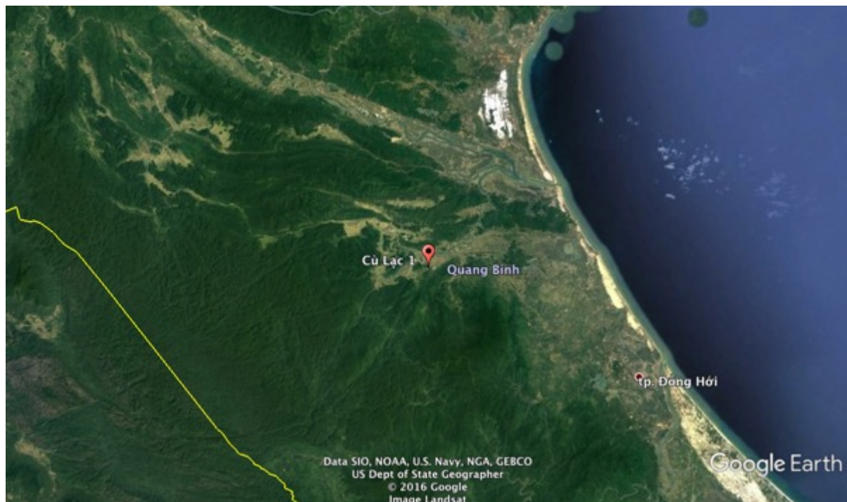
Figure 7: location of Cu Lạc, google earth.

Léopold Cadière, was the mentor of Maunier in Cu Lạc 5 , the small village located North-West of Dong Hoi, which appears as a form of birth place for local ethnographies in the region.