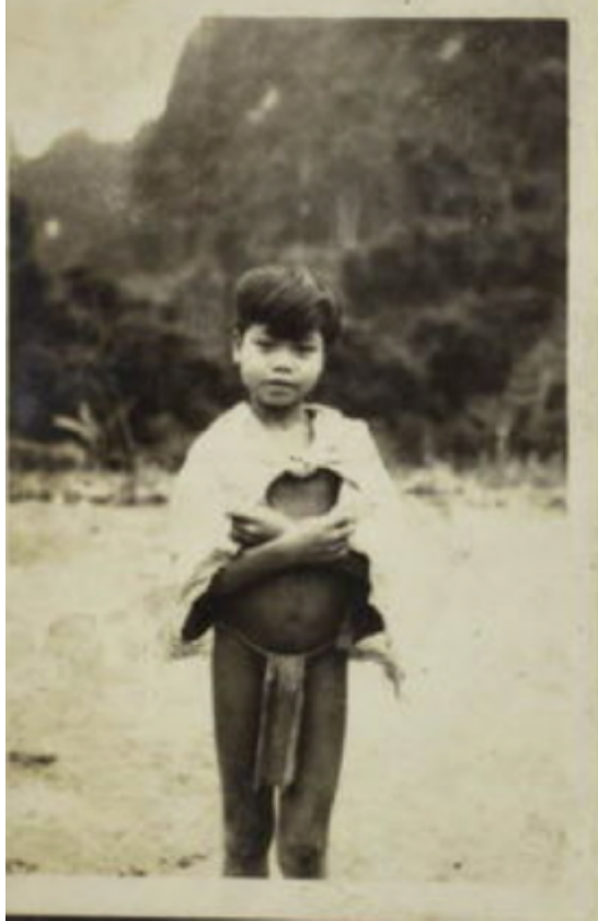
Figure 20: A Ruc child 41

Thus another picture features a boy in traditional attire at a critical moment in their recent, where clothes distribution was one of the things provided through government support in the resettlement area to offer “development”. It was, during my interviews, very difficult to identify the specific members almost five decades later, not least due the low average living age, the absence of many Rục during fieldwork and also the heavy toll of diseases through the years. These documents have historical value and significance.