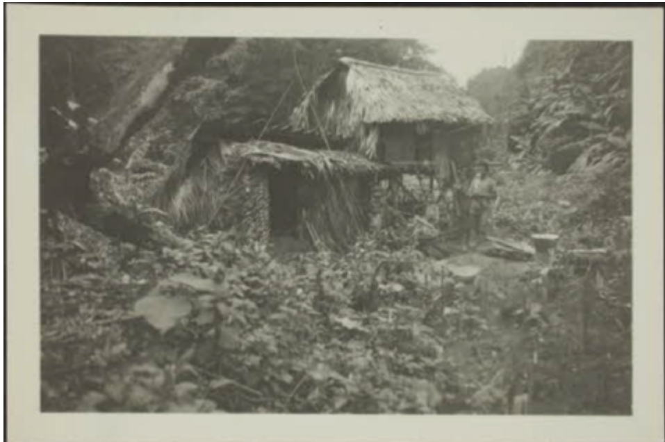
Figure 13: “Le long de la route du téléphérique, vers km. 44. Habitation Ruk.” 33

Indeed, despite ideas of isolation, equally nurtured by Cuisinier herself, the material collected indirectly described interaction with the State and neighbouring groups. A radio broadcast transcription about the Mày, for example, revealed the reluctance of villagers to provide detailed information about settlements to avoid taxation. Pictures also revealed the wider infrastructure context.