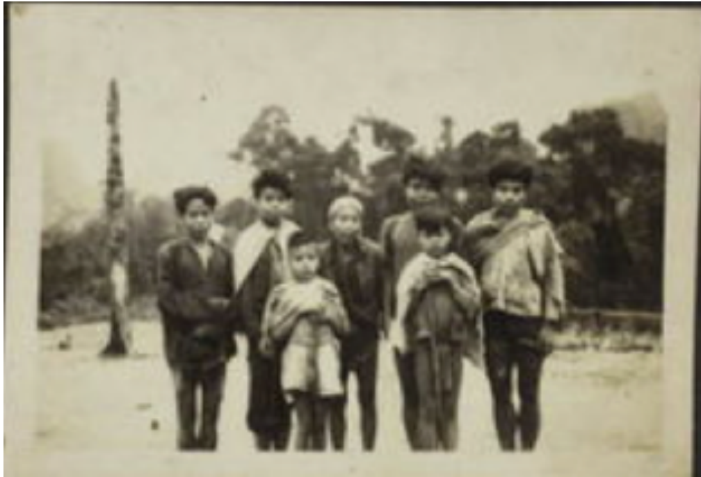
Figure 17: “The Ruc family of Cu Vit (currently listed as “[Gra duing Ruc cu vit : portrait d'un groupe d'adultes et d'enfants]” 38