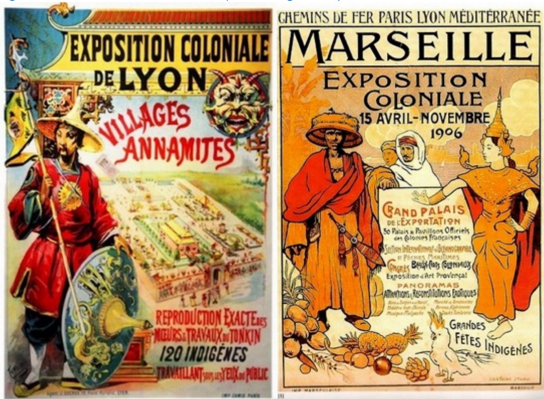
Figure 5: colonial exhibitions and representing alterity

In the manual of ethnography, Marcel Mauss would describe the Moï in Annam as « archaic and protohistorical », not unlike common Kinh perceptions at the time (Cadière 1901). The founding of L'École française d'Extrême-Orient (EFEO) in 1900 would gradually lead to more systematic calls for the description and classification of ethnicity gradually showing a shift compared to say, the exotics of colonial exhibitions at the time.