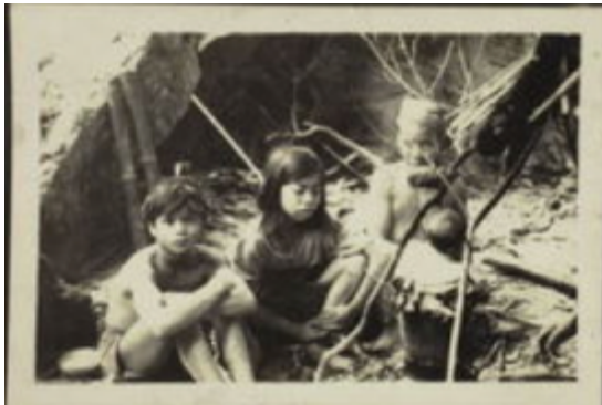
Figure 19: “Ruc in a cave” 40

Cave residence, for some, were signs of people caught in the past, fleeing modernity and contact – which was sought explained.