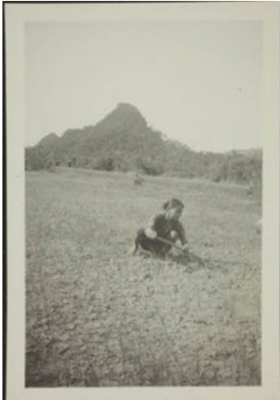
Figure 26: Nguôn, Annam. Dong Hoi. Tuyen Hoà. Qui Dat. Le désherbage des rizières. 45