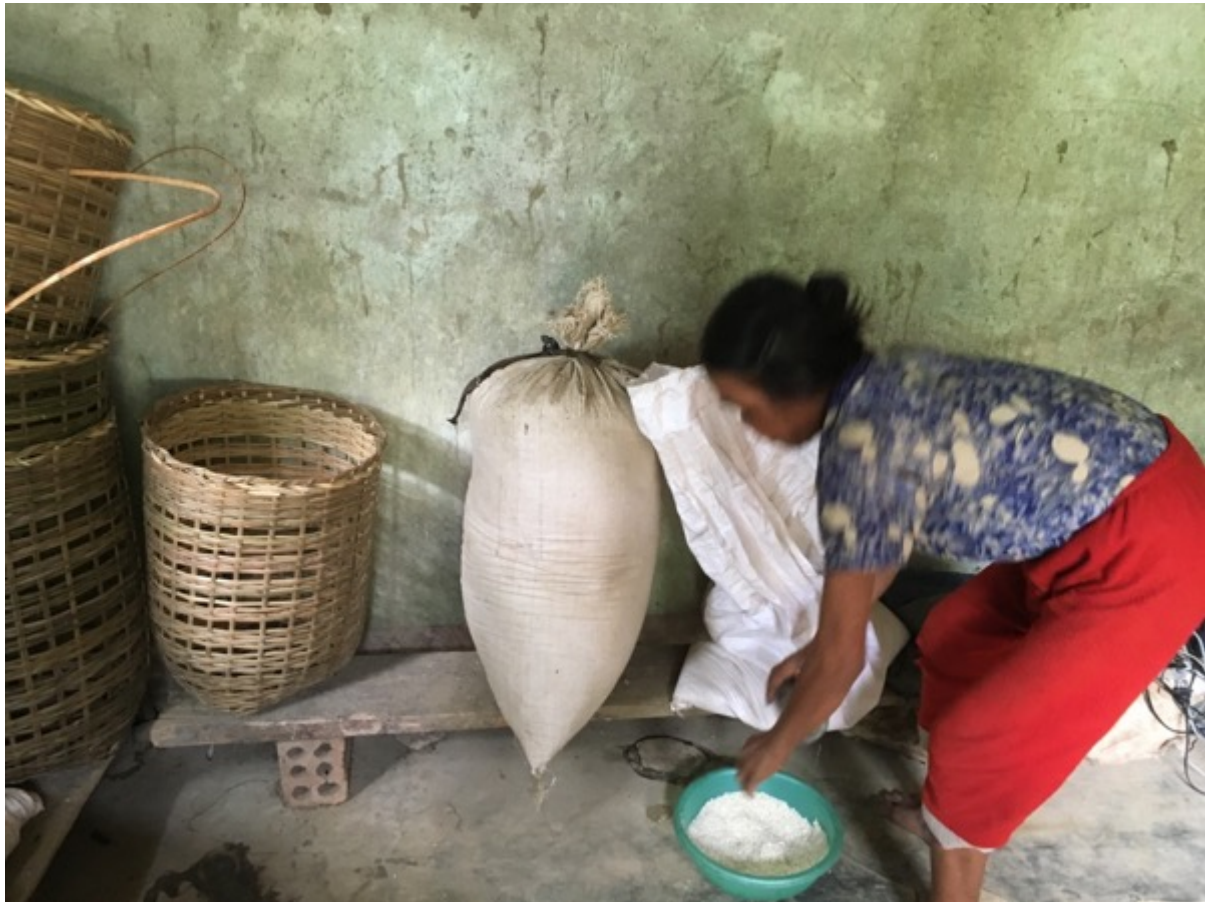
Figure 23: Rice from the sacks, Ban Mo O ò o, 2016

In the following decades, numerous settlement, housing and livelihood schemes have sought to sedentarize the Rục of Thượng Hóa. Disease, failing projects and natural calamities have continuously, however, led many Rục to maintain a hunter-gatherer lifestyle at least on a seasonal basis despite official policy seeking to stop it. Whereas rice subsidy schemes have replaced large areas of people's own rice production 43 , many people continuously depend on forest products for their everyday survival.