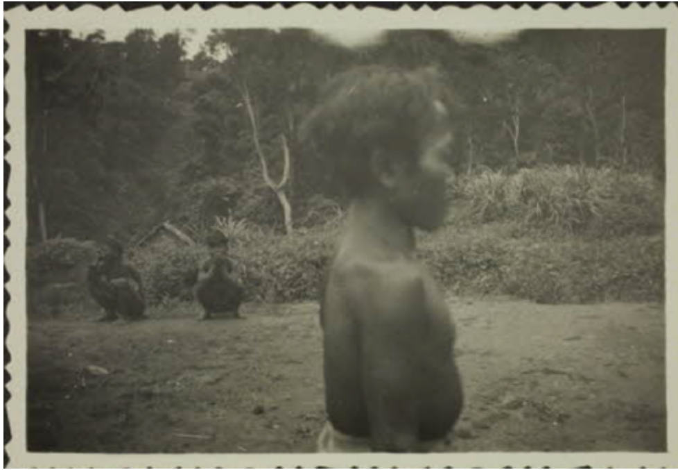
Figure 10: “the profile of the smallest subject” among the Mày 28