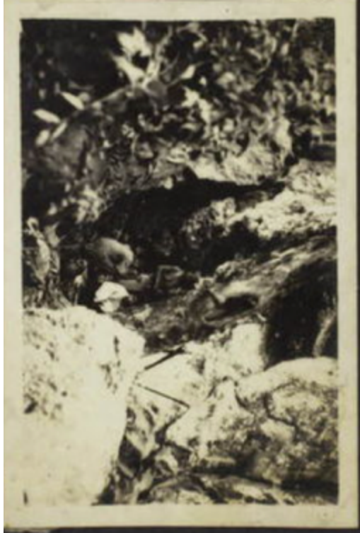
Figure 18: “Ruc in a cave” 39