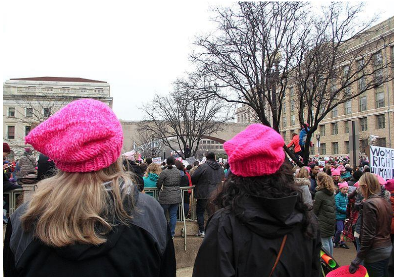
Fig. 4: Feminist activists at the Washington Women March against the president Donald Trump, 2017.

It is no coincidence that millennial pink appeared at the same time as “pop feminism” which spread mainly through the singers Beyoncé, Miley Cyrus or Nicki Minaj (Djavadzadeh, 2017). Several feminist movements of the 2000s also took up the pink as a symbol of political demands: the Gulabi gang in India which campaigned against domestic violence towards women adopted pink sarees to be singled out as members (Berthod, 2012) ; or the “pussyhats,” an American movement of feminists who demonstrated against the presidential campaign of Donald Trump, and whose distinctive sign is a pink woolen hat in the form of cat ears (Hestir, 2018). These feminist groups are creating a shift in the feminine stereotype of pink from gentleness and passivity toward force and rebellion ( fig. 3 ).