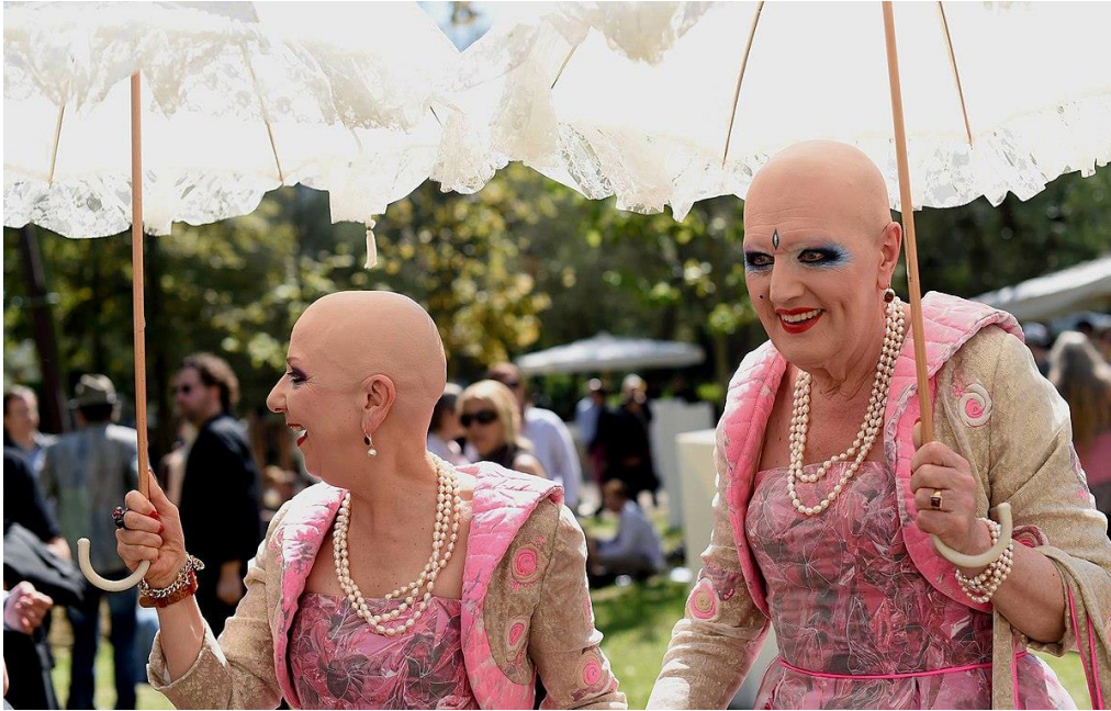
Fig. 5: The German artists EVA & ADELE at the Venice Biennale, 2009.

So, when the singer Zayn Malik appeared on his Instagram account with pink hair, it is mainly because he intended to draw attention to him after the release a few days earlier of his new single. Still, Charli XCX's "Boys" video might not have been as successful if it did not show men dressed in pink and doing so-called feminine activities such as washing dishes, participating in pajamas party, or cuddling a stuffed animal.