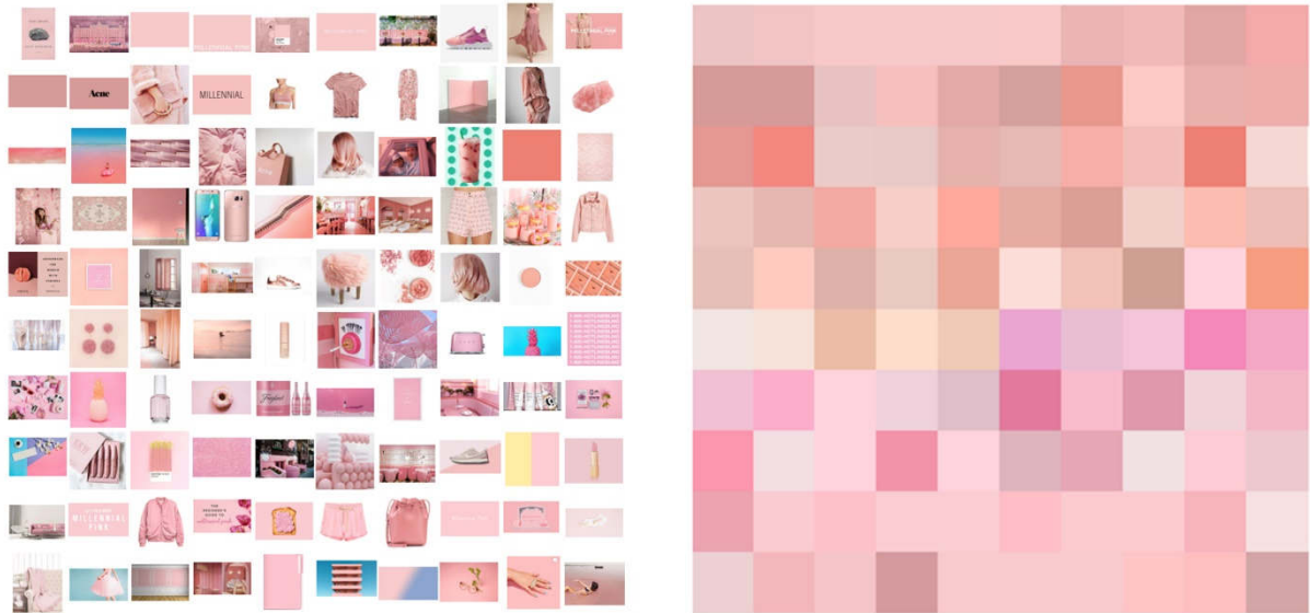
Fig. 1: Color chart of millennial pink. It was obtained from the collection of one hundred images answering the keyword “millennial pink” on the internet, in September 2017.