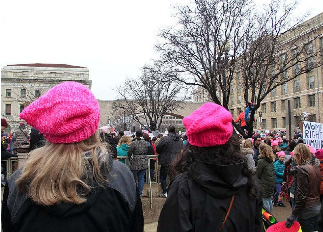
Fig. 4: Feminist activists at the Washington Women March against the president Donald Trump, 2017.

The (re)politicization of pink goes hand in hand with the millennial pink trend, and many brands took advantage of the acknowledgment of pink as the color of feminism, even post-feminism. Millennial pink is thus used in marketing strategies that since about 2014 have appropriated the feminist struggles to sell products to female consumers, vastly educated to feminist theories. These consumers also do not hesitate to denounce sexism in marketing, and particularly in advertisement. This new strategy is called “femvertising” (contraction of “feminism” and “advertising”), and consists in using feminism to sell, by exploiting the feminist concept of empowerment and body-positivism, by playing with gender stereotypes using a queer aesthetic, or by reclaiming the codes of girl power (Milcent, 2017, p. 20).