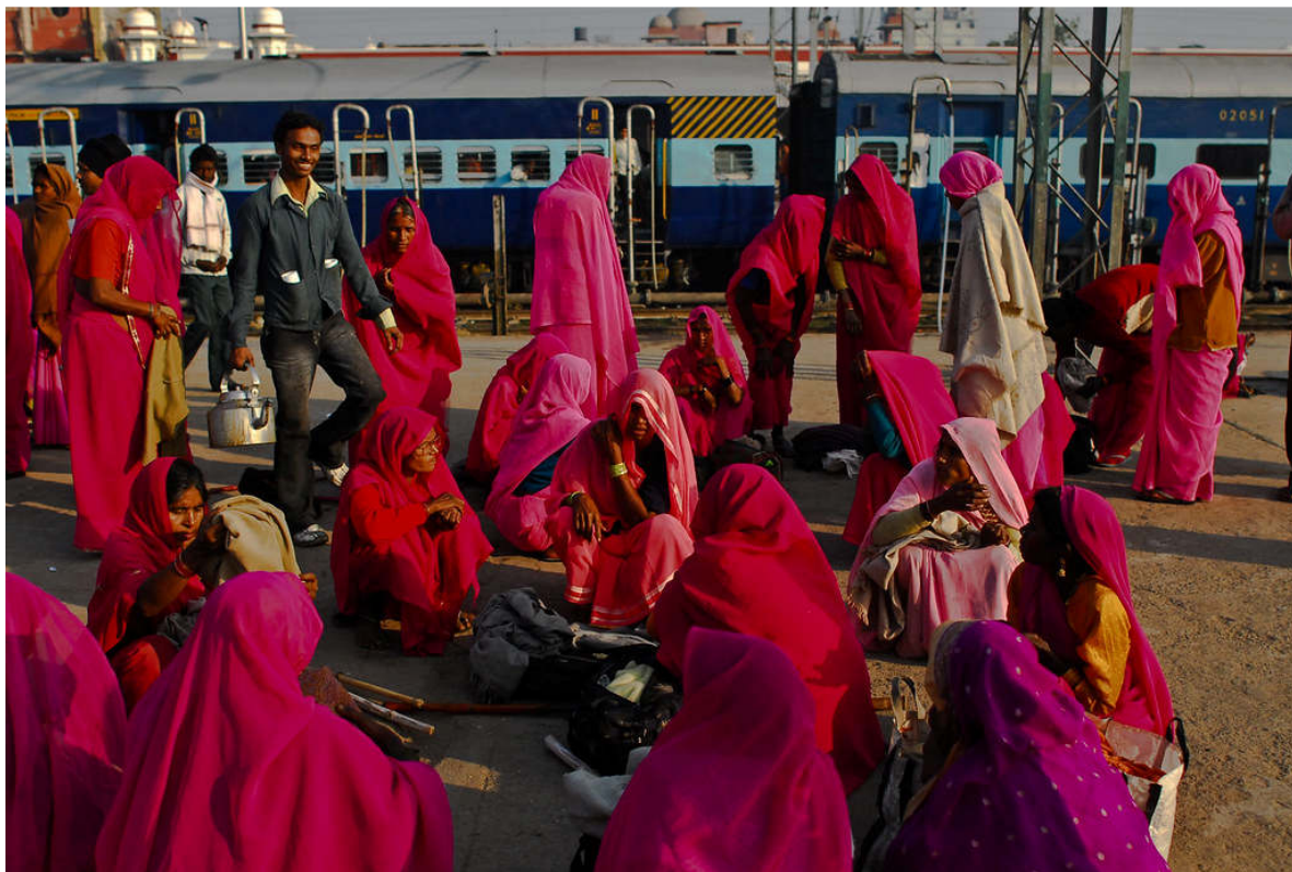
Fig. 3: Some women activists of the Gulabi Gang in Bundelkhand, a rural region of India, 2009 (© Blindboys.org/Flickr).

It is no coincidence that millennial pink appeared at the same time as “pop feminism” which spread mainly through the singers Beyoncé, Miley Cyrus or Nicki Minaj (Djavadzadeh, 2017). Several feminist movements of the 2000s also took up the pink as a symbol of political demands: the Gulabi gang in India which campaigned against domestic violence towards women adopted pink sarees to be singled out as members (Berthod, 2012) (fig. 3); or the “pussyhats,” an American movement of feminists who demonstrated against the presidential campaign of Donald Trump, and whose distinctive sign is a pink woolen hat in the form of cat ears (Hestir, 2018). These feminist groups are creating a shift in the feminine stereotype of pink from gentleness and passivity toward force and rebellion (fig. 4).