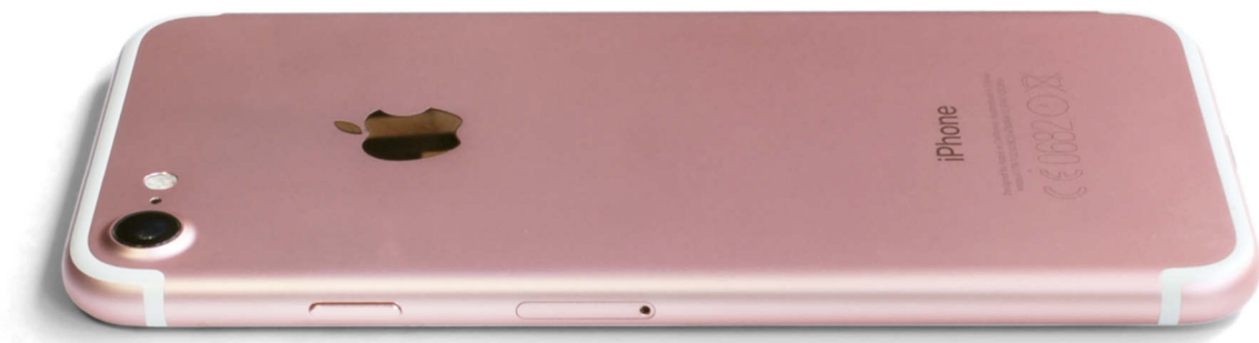
Fig. 5: iPhone 7 “Rose Gold”, successor of the iPhone 6S, 2016.

When Apple released the “rose-gold” color of the iPhone 6S in September 2015, this new color challenged the internet, because Apple seemed to offer for the first time a smartphone to only one part of the population: women (fig. 5). Since colorful objects are strongly associated with the feminine in the West, the men who dare to wear pink clothes or to have pink accessories are still few. This new color is considered too feminine and not manly enough, and very quickly, media and web forums asked themselves the question: can men have a pink iPhone? (Blanchard, 2015). Medias even suggested to rename it “bros’ gold” to reassure the consumer that the purchased product is intended for him (Chmielewski and Deamicis, 2015).