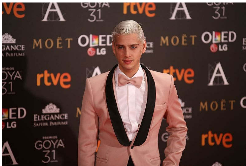
Fig. 6: The young Spanish film-maker Eduardo Casanova at Premios Goya, 2017.

Furthermore, if the media are not slow to take an interest in the appearance of Drake with a pink jacket, Justin Bieber with a pink hoodie, or Kanye West who often appears in pink, the extension of millennial pink to the male wardrobe is seen by some media as a feminization of men's fashion, a movement from feminine to masculine often at work when it comes to unisex fashion. It must also be added that we must not confuse sex and sexual wear of clothing, and there are always women's and men's cuts, in addition to unisex cuts (Guionnet and Neveu, 2009, p. 46): if men wear more and more pink, it colors either costumes (fig. 6) or streetwear.