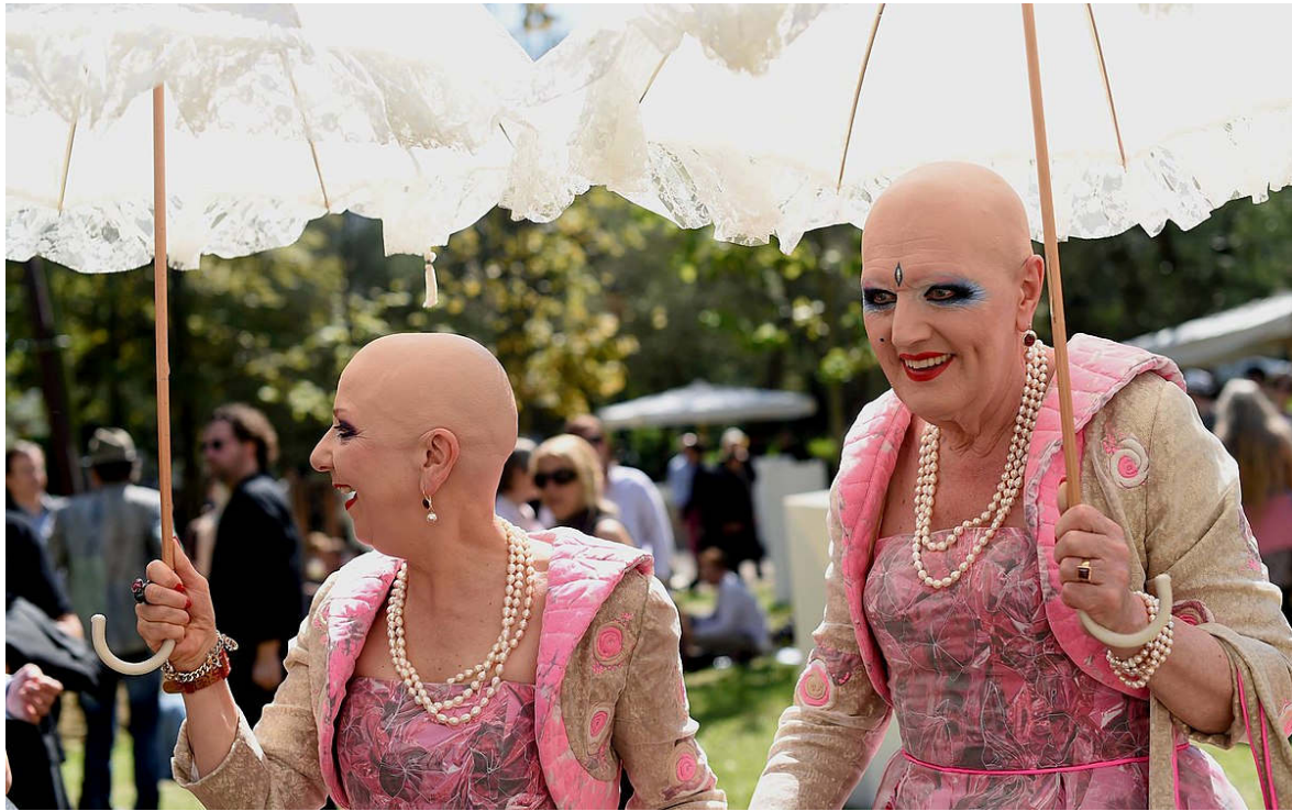
Fig. 7: The German artists EVA & ADELE at the Venice Biennale, 2009 (© Arben Llapashtica/Wikimedia Commons).

so for time” (Paoletti, 2012, p.99). This process is not new, and already in 2005 Le Stade Français, the French rugby team, was noticed by choosing to wear pink jerseys.