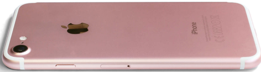
Fig. 5: iPhone 7 “Rose Gold”, successor of the iPhone 6S, 2016 (© MacRepairDundee /Wikimedia Commons).

When Apple released the “rose-gold” color of the iPhone 6S in September 2015, this new color challenged the internet, because Apple seemed to offer for the first time a smartphone to only one part of the population: women (fig. 5). Since colorful objects are strongly associated with the feminine in the West, the men who dare to wear pink clothes or to have pink accessories are still few. This new color is considered too feminine and not manly enough, and very quickly, media and web forums asked themselves the question: can men have a pink iPhone? (Blanchard, 2015). Medias even suggested to rename it “bros’ gold” to reassure the consumer that the purchased product is intended for him (Chmielewski and Deamicis, 2015).