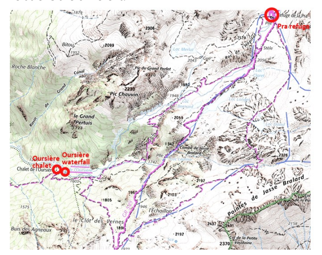
Figure 1. Example of an annotated topographic map highlighting the identified reference features used in a call (same call as sketch map of Figure 3).