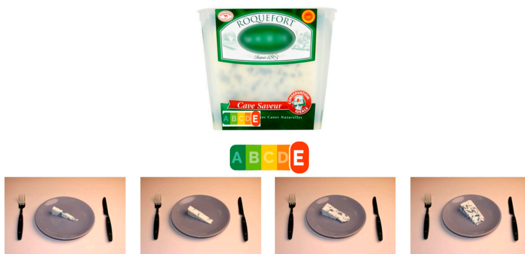
Figure 2. Example of one of the cheese products in the Nutri-Score condition, with the four portion size proposed.

Each participant was exposed to the three food categories and to a set of four products for each category, resulting in the assessment of 12 products overall. They were exposed to the four labelling conditions (ENL, MTL, Nutri-Score, and control without any FoPL) in each set of four products. The order of presentation of the food categories, the order of presentation of the food products and the combination of products*labelling conditions were all randomised, in order to avoid any priming effects. For each food product presented to the subjects, they were invited to select a photograph corresponding to the portion size they would choose to consume, irrespective of their usual consumption. An example of the portion size task is presented in Figure 2. Then, participants had the possibility to select the number of portions (of the size they chose) to indicate the number of portions they would consume on a given eating occasion (between 1 and 4 portions).