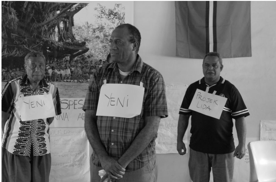
FIGURE 4 Yeni (or iani) present their duties as chiefs at a workshop on kastom governance in Lenakel, Tanna, July 2011.