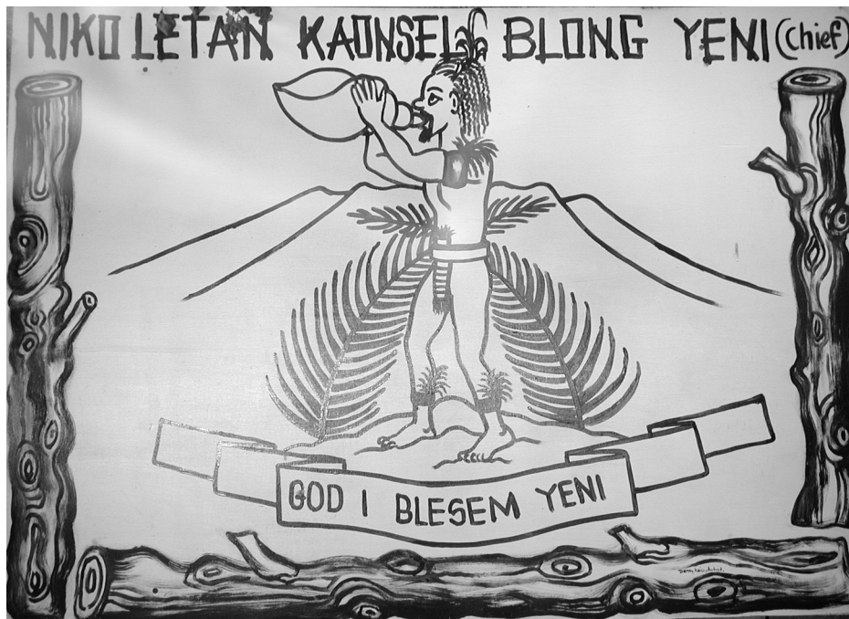
FIGURE 3 Logo and motto of the Nikoletan council of chiefs, July 2011.

Thus, the business of codifying kastom was delegated to the island or district council level. In Tanna, the Nikoletan council swiftly began the task with considerable enthusiasm. Some of its members formed a committee to work on a “Tanna island kastom” project. A forty-five-page booklet written in Bislama was typed and, in 1985, officially declared by this neo-customary body to be “the true kastom law of Tanna” (D’Arcy 1994, 6). This document is remarkable in many of its contradictory aspects, but its main interest lies in how it tries to codify selected, nondiversified elements of local customs by focusing obsessively on the power of chiefs. According to its subtitle, “true kastom” on the island is the “Law of Tanna Chiefs.”