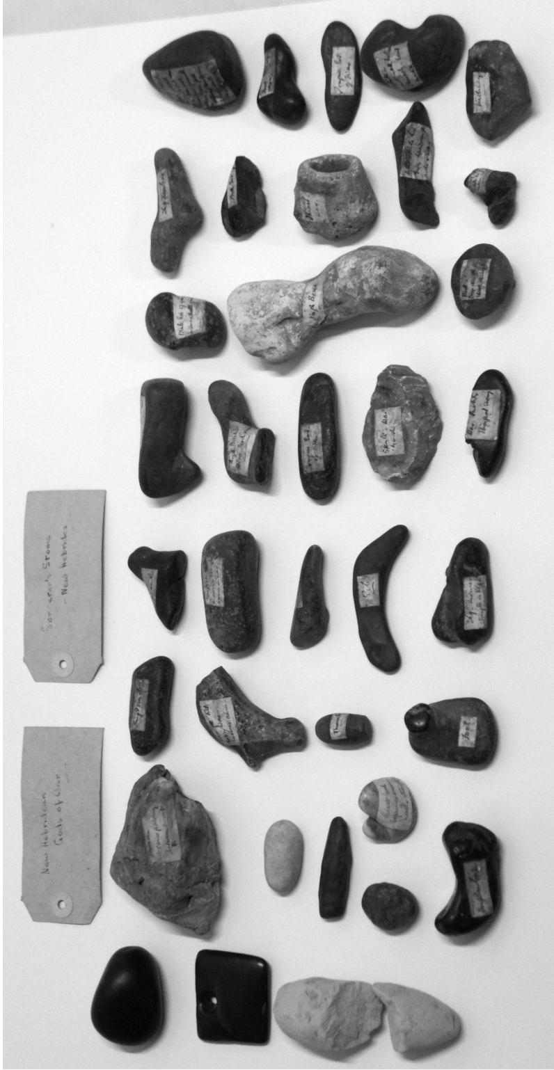
FIGURE 1 A collection of nabak stones from the Vanuatu Cultural Centre, March 2012.