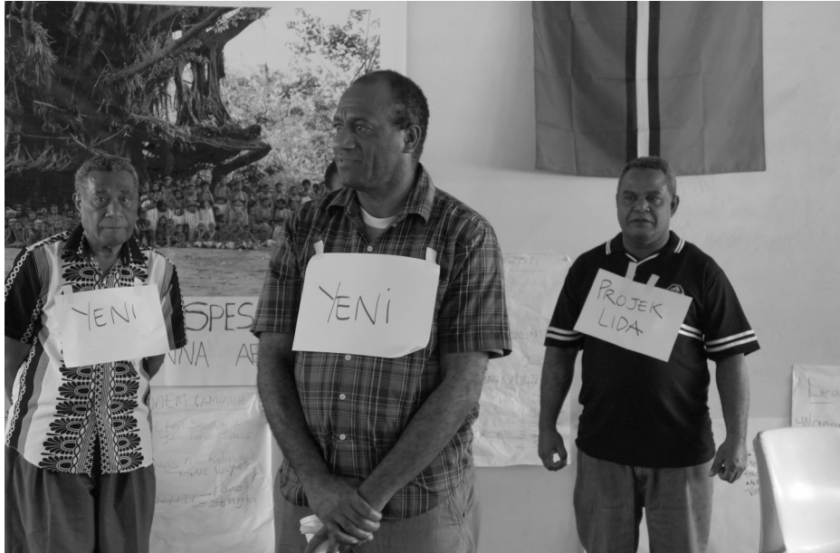
FIGURE 4 Yeni (or iani) present their duties as chiefs at a workshop on kastom governance in Lenakel, Tanna, July 2011.