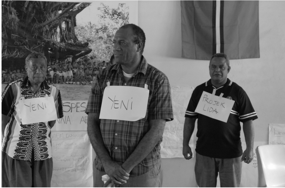
FIGURE 4 Yeni (or iani) present their duties as chiefs at a workshop on kastom governance in Lenakel, Tanna, July 2011.