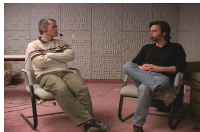
Figure 1. Example settings of MITo (left) and the CID (right)