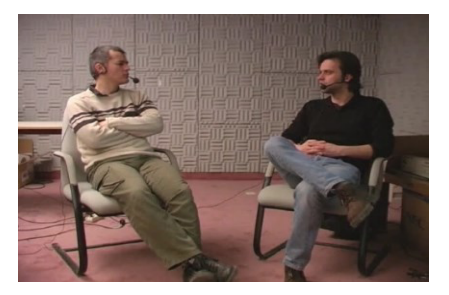
Figure 1. Example settings of MITo (left) and the CID (right)