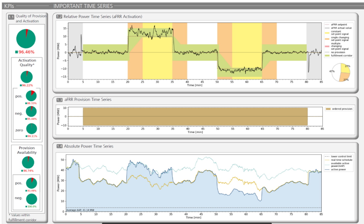
Figure 2: Results from a test for FCR and FRR with 4 power plants in Germany and France.