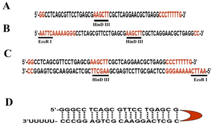
Figure 2. An example of used oligos for shRNA vector. (A) Oligo 1 contains a two complementary sequences (in black) that can be formed upon shRNA transcription, a hairpin structure. A Hind III site forms the hairpin structure (see figure 2D in red). (B) Oligo 2 is complementary of oligo 1. Both oligos are designed against mouse Fgfr2. (C) Annealed Oligos 1 and 2. (D) Predicted hairpin structure with the corresponding colors (black: target sequence; red: Hind III site for hairpin).