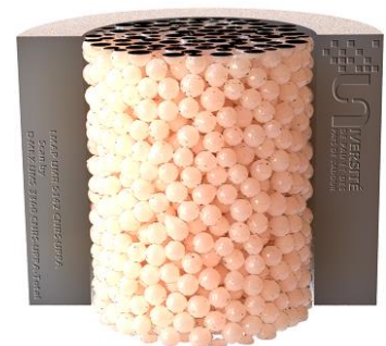
Figure 3: image rendering of a reconstructed 3D volume of spheres stacked inside the cell